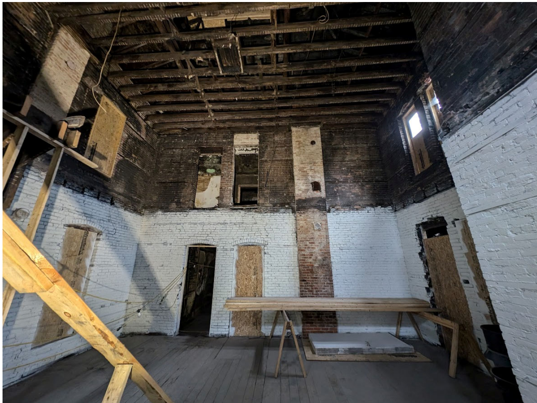
Opposite view of main house interior, looking east towards rear. Note complete two-story brick wall closing this portion off from the additions/wings. September 30, 2024.