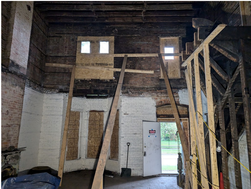
Interior view of main house interior, looking towards front door/Lincoln. Note complete lack of second floor and bracing in place to support exterior brick walls. Staff photo, September 30, 2024.