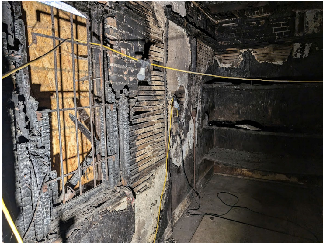
Typical damage at rear addition. Note condition of window. September 30, 2024.