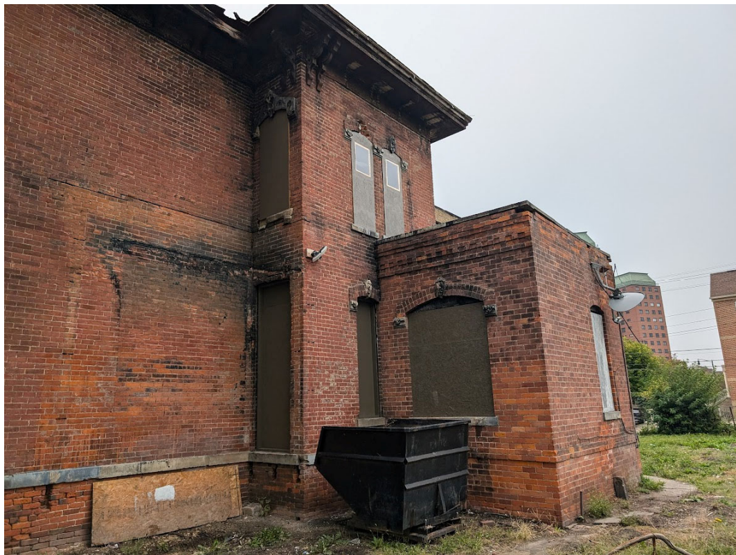
Another view of the "south-extending addition". The wall fronting the dumpster, featuring the large arched window, will be preserved, whereas the south facing wall (at right) will be replaced with sunroom windows extending further south. September 30, 2024.