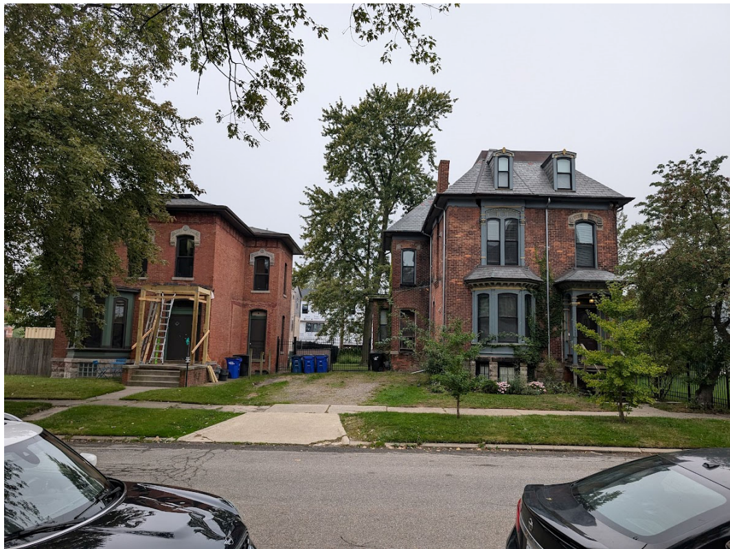
View across Lincoln to the west, showing 3627 Lincoln (c. 1875), which is called out in the HDAB report and shares similar features to the subject property. To the right is 3643 Lincoln. Staff photo, September 30, 2024.