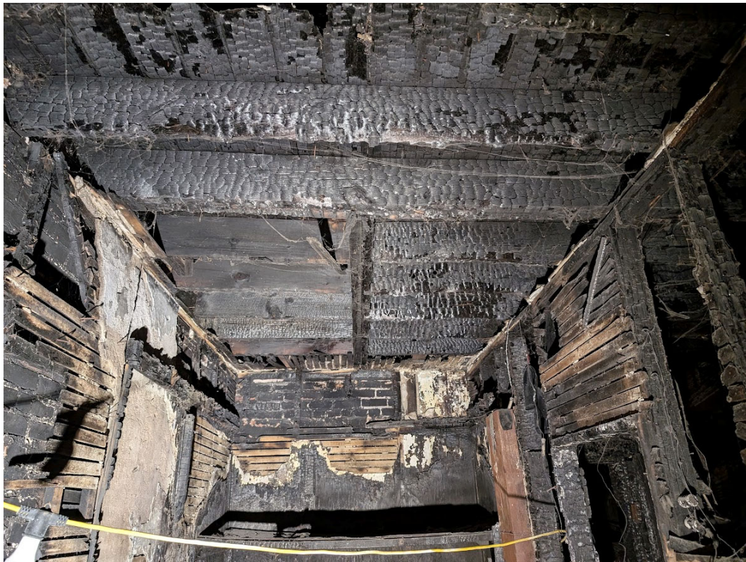
Typical interior damage at rear addition/wing. Staff photo, September 30, 2024.