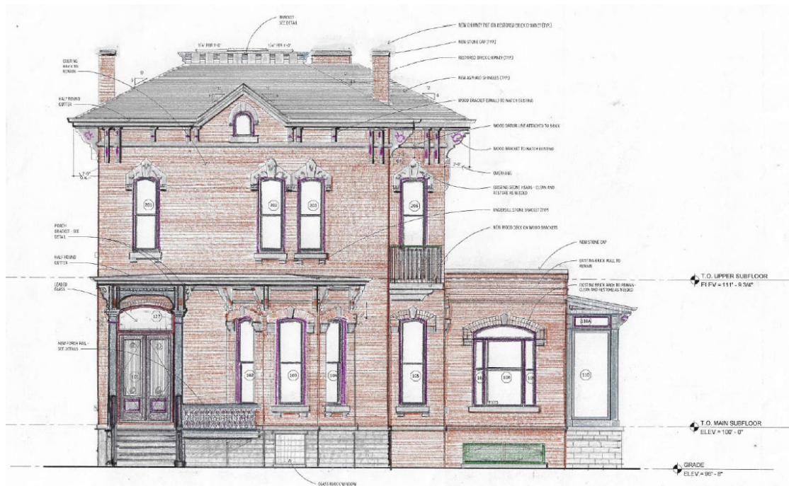
Proposed west (front) elevation of the nineteenth-century house. Not to scale

This of course is entirely consistent with Secretary of the Interior’s Standards 5 and 6, which read: