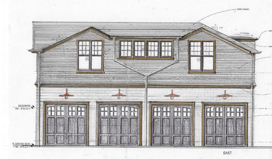
East (alley) elevation of the four-bay garage/carriage house. Not to scale.