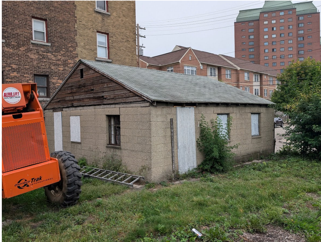
View to the northeast showing existing block garage. Note high density development in vicinity. Staff photo, September 30, 2024.