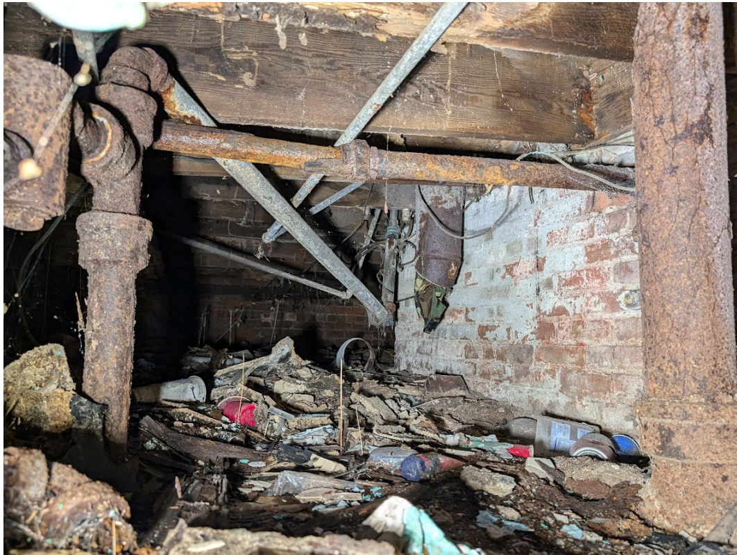
View of the crawlspace beneath the south-extending addition, taken from basement of main house. Staff photo, September 30, 2024.