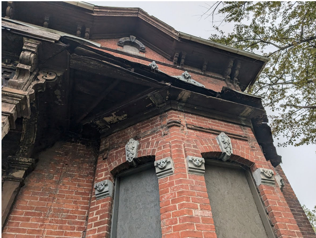
View towards top of front bay window, showing original surviving stone and wood detailing. Staff photo, September 30, 2024.