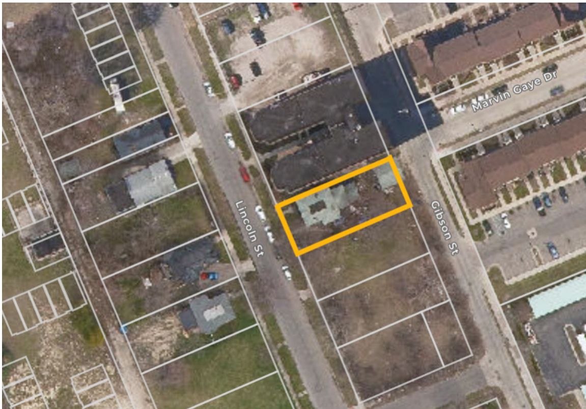
Parcel at 3644 Lincoln per Detroit Parcel Viewer, outlined in yellow. The current owner also owns the adjacent parcel to the south, to be combined into a large lot (fence/berm already approved). Note juxtaposition between very high density/lot coverages and vacant parcels to north, south, and west. Two parcels further south of the subject property (3606-3618 Lincoln, 1532 Brainerd) have already received HDC approval for a multi-family development with high lot coverages and additional density.

The Woodbridge Farm Historic District, even at its designation in 1991, was marked by large areas of vacant lots approaching 50% of the total district. As the Commission knows, the more dense, historically intact section of Woodbridge is to the west/north-west of the local district, and is not in the Commission's jurisdiction (Woodbridge along Avery, Commonwealth, et al., is a federal National Register district, not local). In the much smaller local Woodbridge Farm district, since local designation, even with historic district protection , the loss of historic buildings has continued at a dispiriting pace. Starting with somewhat less than 50 extant structures across eight city blocks, the district has lost at least 8-10 buildings since 1991, based on our analysis and records. Of the thirteen architecturally important buildings specifically described in the HDAB report, four of those are now gone. These represent devastating losses of 20-30% of the district's already diminished 1991 historic fabric. More optimistically, in the last 3-5 years, at least four new construction projects (including very large projects at the former Scripps mansion site, a new multi-family building at 4130 Trumbull, and a recently approved multi-family project at the corner of Lincoln and Brainerd), have begun to rebuild vitality and density. Many other properties have seen rehabilitation efforts as the district recovers.