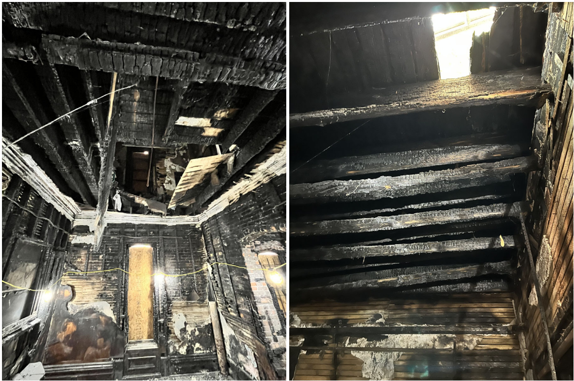
View into the south-extending wing showing extent of fire damage, including collapsed floor and bowed roof joists. This area, excepting the west (front) facing wall visible in the photo below, will be replaced by a sunroom. Applicant photos, September 30, 2024.