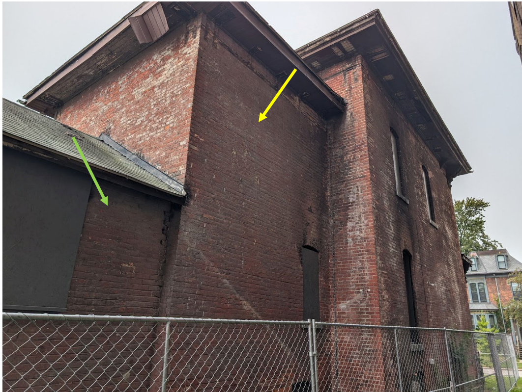
View to the southwest at north property line, towards Lincoln. The main house portion is at right. Yellow arrow shows two-story wing to be replaced with “hyphen”, green arrow shows gable-roofed addition. Staff photo, September 30, 2024.