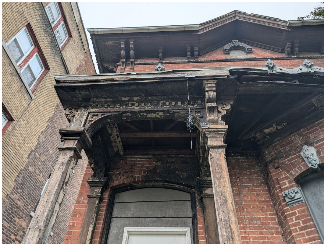
View of front façade/entry porch. Staff photo, September 30, 2024.