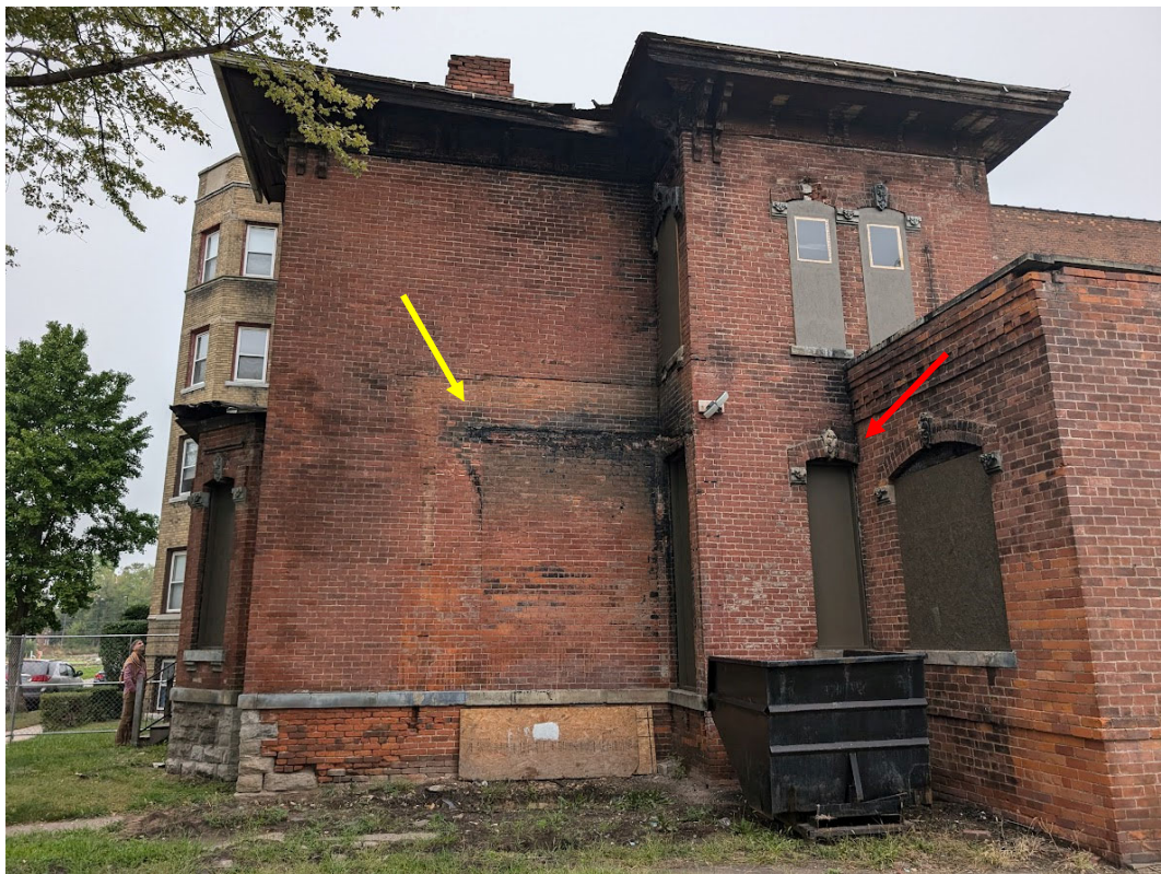
View to the north, showing south-facing wall of main house and, to the right, the oddly attached "south-extending addition" which awkwardly intersects with one of the original windows (red arrow). Ornament from another window was apparently moved to this new wing's window, or perhaps sourced from the same supplier. The wing has only a crawlspace, while the original house has a full basement. This interesting historic condition will be preserved in the proposal. Note "ghost" of former frame porch (yellow arrow). September 30, 2024.