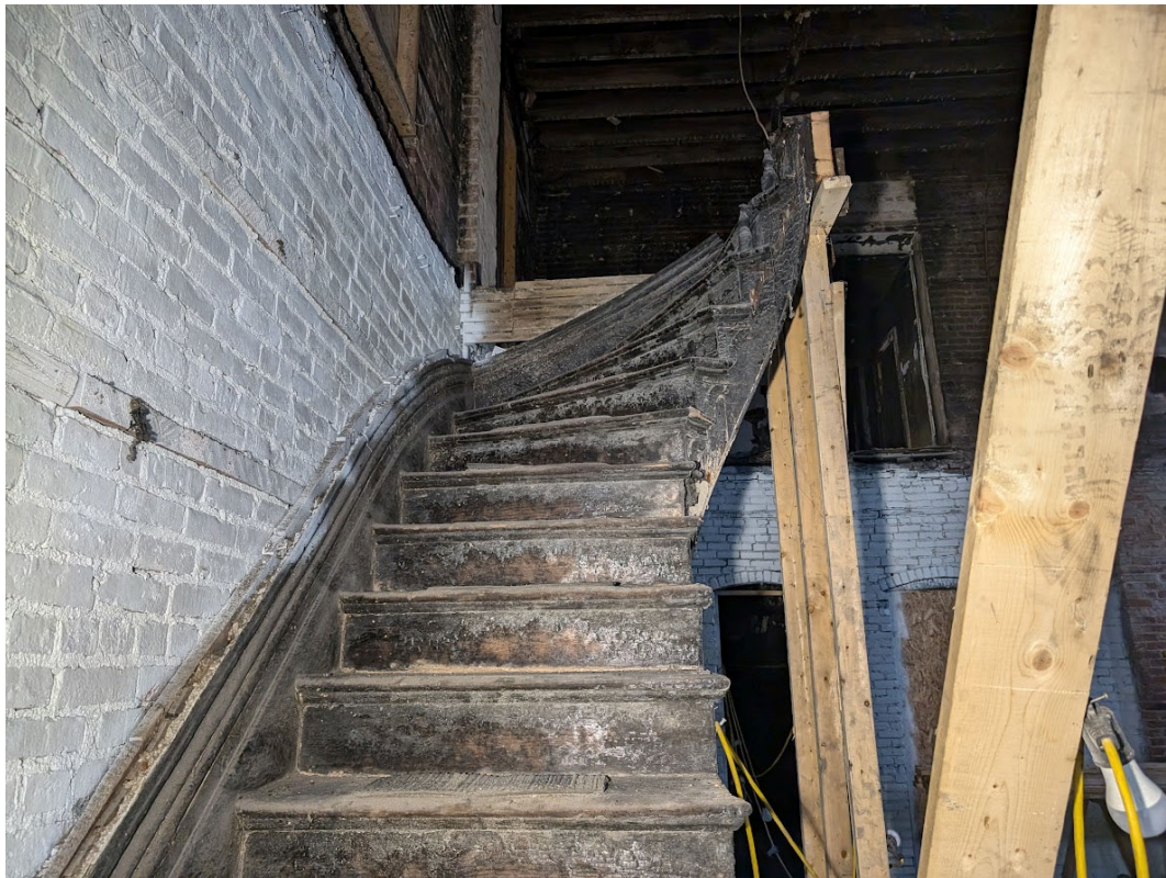
Detail view of salvaged and braced interior monumental stair, prepped for rehab. Staff photo, September 30, 2024.