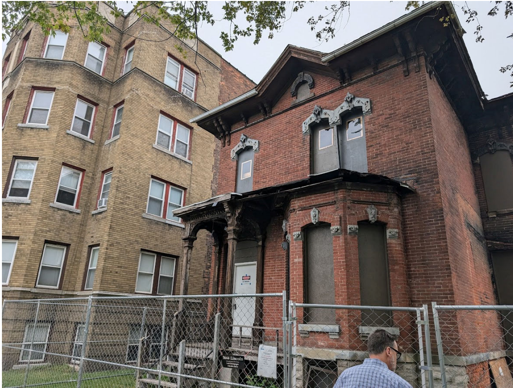
View of existing nineteenth century house at 3644 Lincoln. Note immediately adjacent 5-story apartment building. September 30, 2024.

SCOPE: DEMOLISH REAR WINGS, CONSTRUCT NEW REAR ADDITION, REHABILITATE EXTERIOR. DEMOLISH GARAGE, ERECT NEW CARRIAGE HOUSE