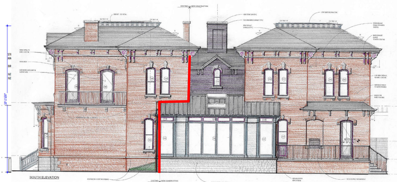
South (side) elevation of the expanded house, rendered with materials, from applicant’s submission materials. Staff has added red line to clarify existing (left) vs. new (right) construction. Front elevation pictured later in this report. Not to scale.

Also included in the scope of work is demolition of the existing 2-bay concrete block garage, and replacement with a carriage house-style (2-story) garage. Instead of Italianate, this new 4-bay garage is carefully designed in a historic style which appears to be rooted in the shingle style (albeit with siding) and other related early 20 th century precedents. Select images from the applicant’s full drawing set are shown below for reference. Salvaged/matching brick and block will be used in both new construction pieces.