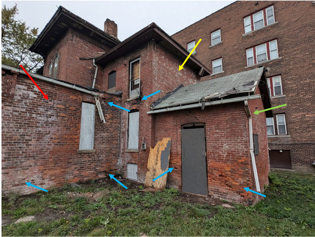
View towards the northwest, showing rear additions/wings proposed for alteration/removal. To the left, the “south-extending addition” is marked with a red arrow. The two-story wing in yellow, and the gable-roofed addition in green. Note substantial brick distress (blue arrows). Staff photo, September 30, 2024.