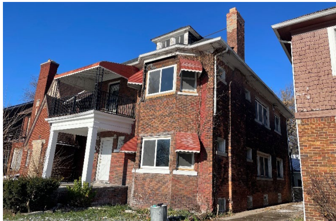
Site Photo 3, by Staff November 28, 2023: (South) front elevation, showing side wood windows replaced with vinyl windows.