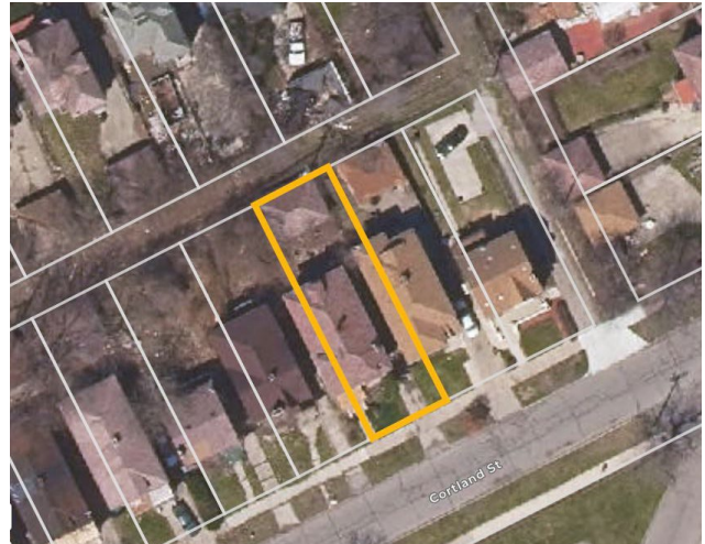
Aerial of Parcel # 14004594.