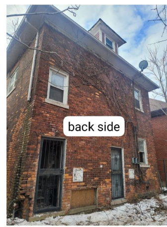
Site Photo 4: (North) rear elevation.