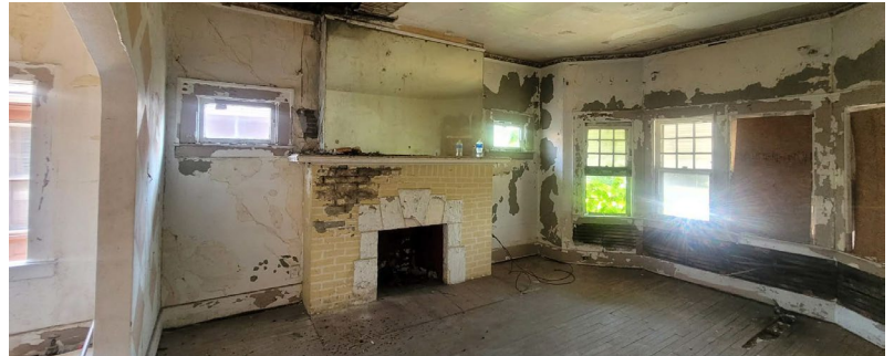
Site Photo 7, by Applicant 2023: Interior, looking towards front bay and east side of the house, showing original windows by fire place and 9/1 configuration of wood windows in the front bay.