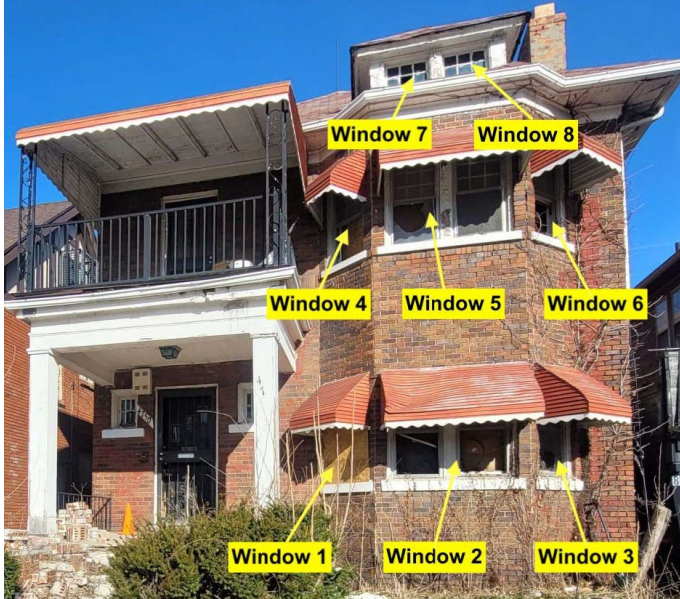
Site Photo 5, by Applicant 2023: (South) front elevation, showing proposed replacement locations of windows 1-8.