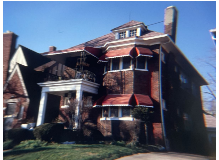
Designation Slide, 1999: (South) front/side elevation showing original windows, porch, entrance, and roof. Note chimney support.

This property has the following HDC approvals and violations for work done without approval on Detroit Property Information System (DPI):