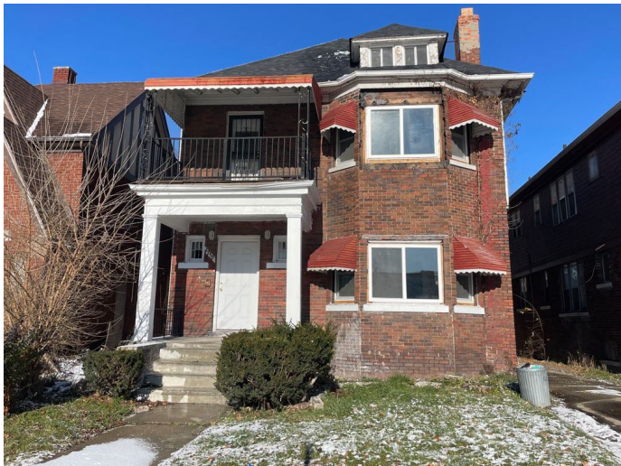
Site Photo 1, by Staff November 28, 2023: (South) front elevation.

Erected in late 1919, the two-story dwelling at 4750 Cortland has a hipped roof with asphalt shingles and features a dormer and brick chimney and walls are clad in red brick in a running bond pattern. The wood-clad dormer once featured wood casements with nine-divided light configuration and sits over a two-story bay with wood, 9/1 divided light windows on top of cast-stone sills. All windows have been recently replaced with vinyl windows without approval. Some of the windowsills and brick cladding are missing. The windows were all once hooded with metal awnings that matched the balcony roof, which centers over the front porch and supported by wood pillars. The wood paneled front door has been replaced with a steel door without approval. The entrance is flanked by wood casement windows that remain with heavy stone sills and nautical-style sconces, which were installed without approval. Both the porch and balcony original metal railings and supports remain. The front porch is raised with a concrete surface and brick wing-walls that hug the stairs leading to the front yard, flanked with foundation evergreens.