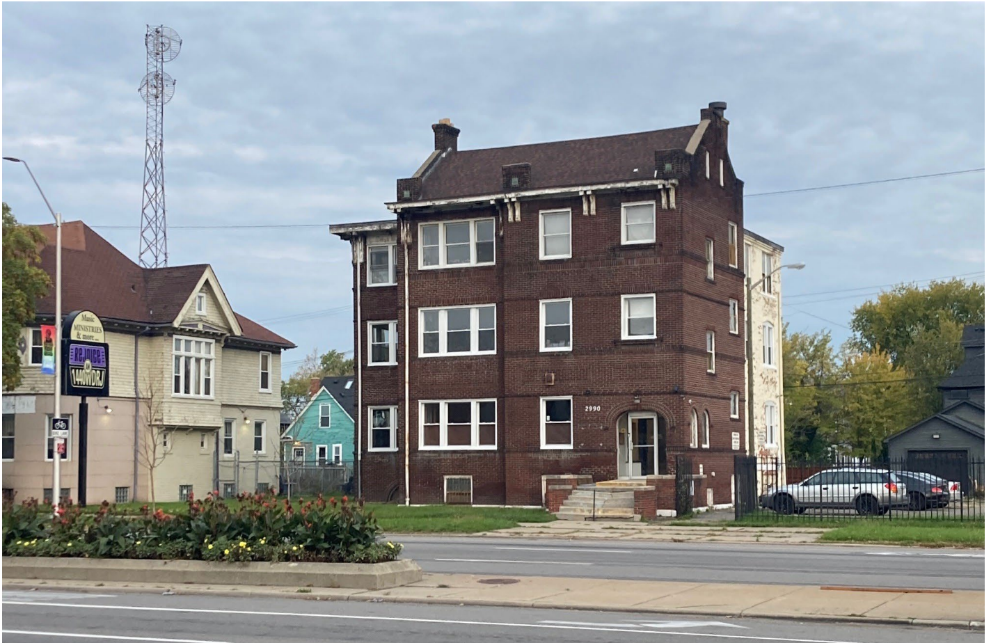
Figure 1: View of 2990 E. Grand Blvd., looking north-northwest.

The building at 2990 E. Grand Blvd. is a three-and-a-half story colonial revival apartment building constructed ca. 1910. Sanborn Maps indicate the building was originally constructed as an apartment building. The property served as the Detroit NAACP headquarters during the mid-20th century. The building's character-defining features include paired brackets at the eaves, gabled parapets, false chimneys that rise from the façade, and patterned brickwork on the main block of the building.