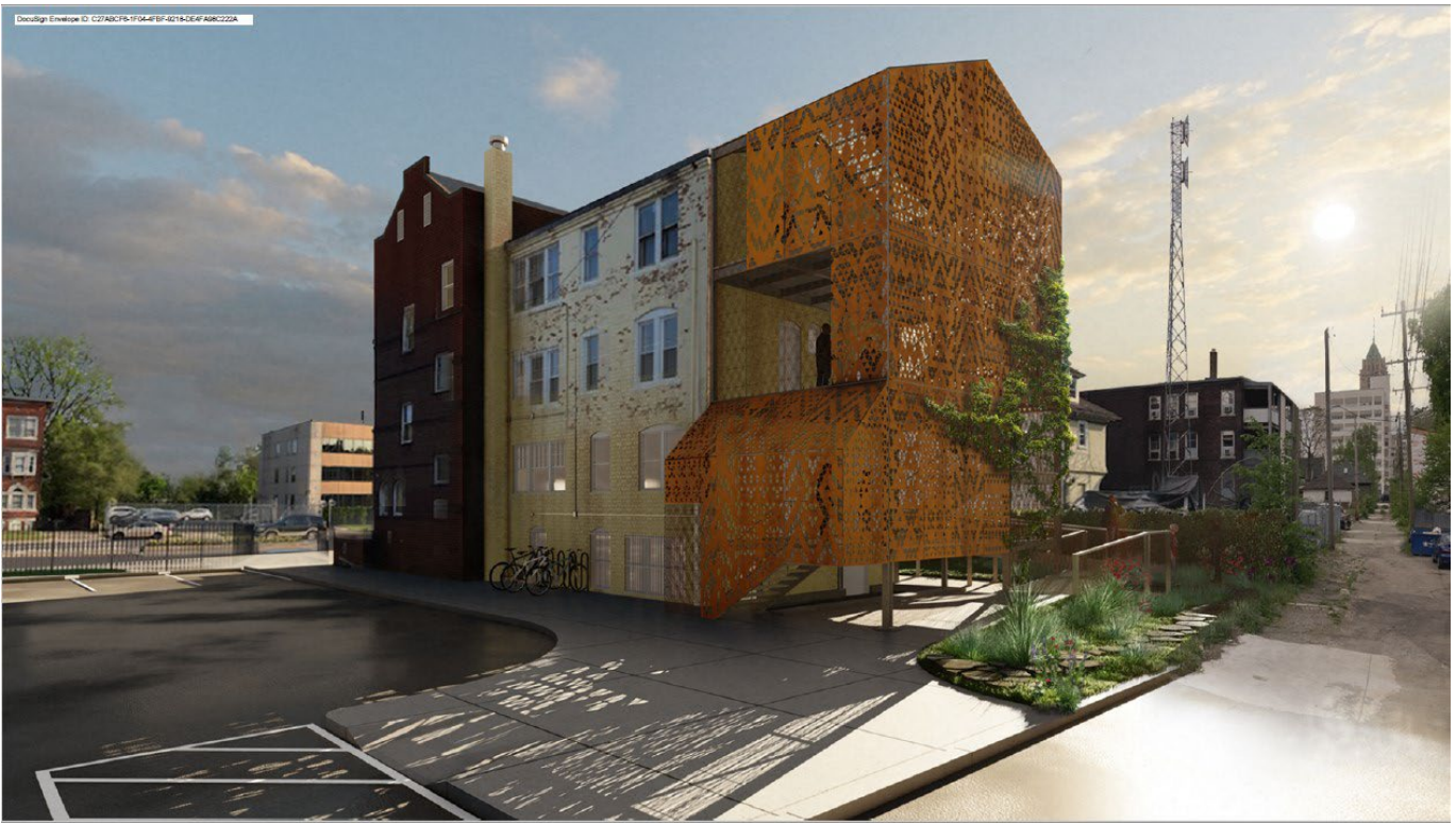
Figure 3: Rendering of the proposed stair and ramp structure.