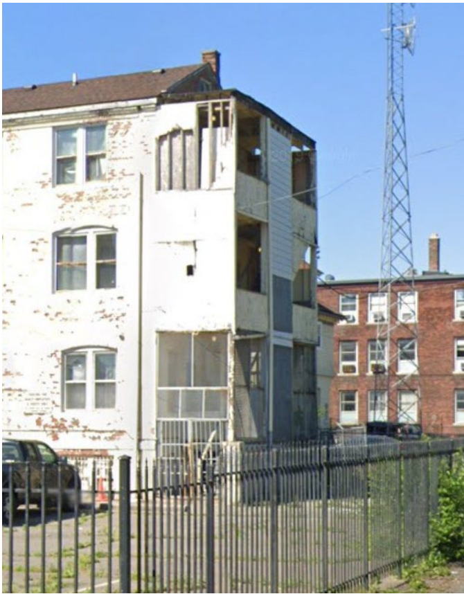
Figure 5: View of the previous rear stair in 2019.