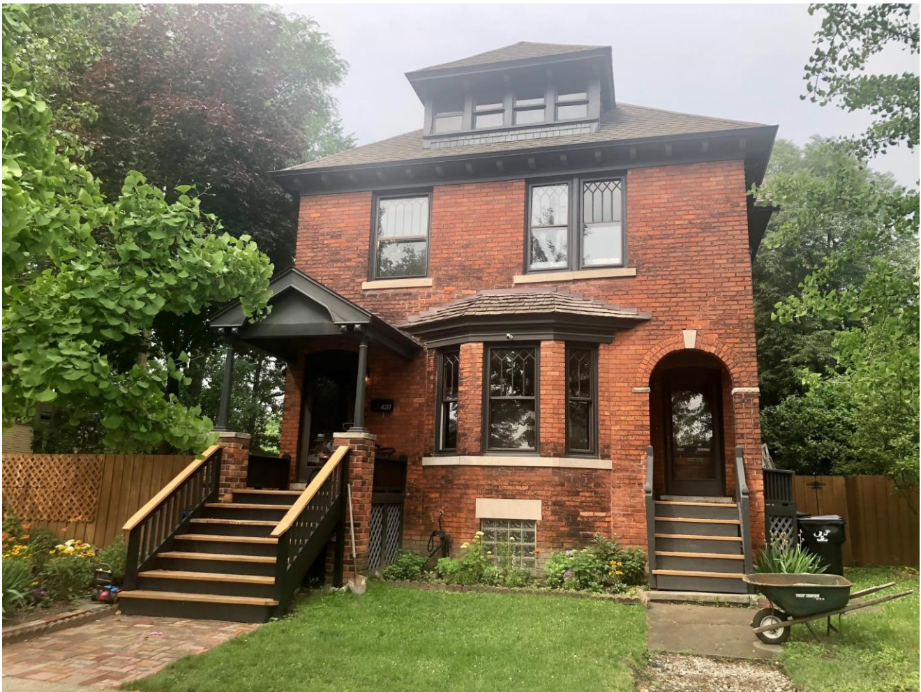
June 29, 2023.

Double-hung windows are the dominant window operation; first and second floor windows at the front elevation have a decorative upper sash muntin pattern, while the dormer windows and side and rear elevations are one-over-one.