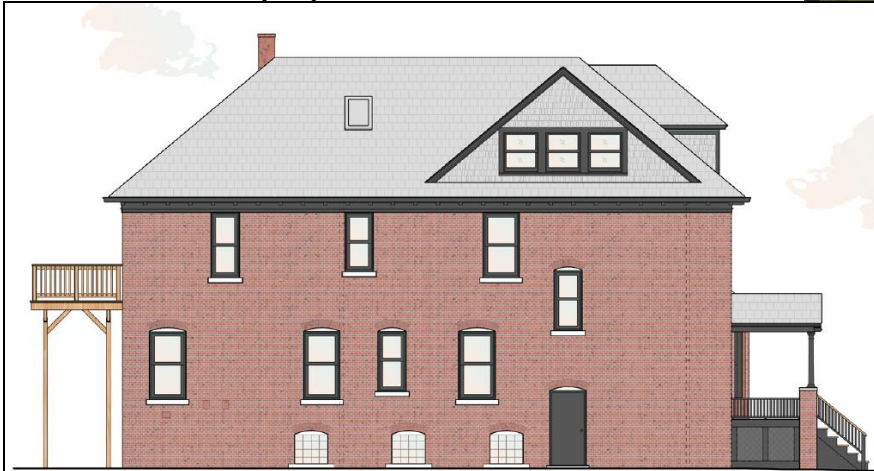
Above: Applicant rendering, south elevation.