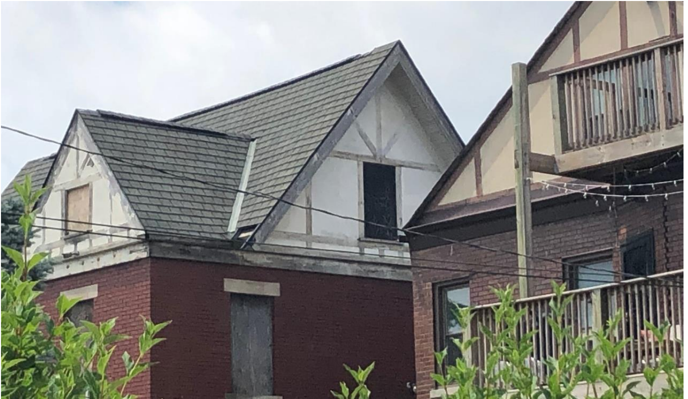
Side (east) and rear (south) gables