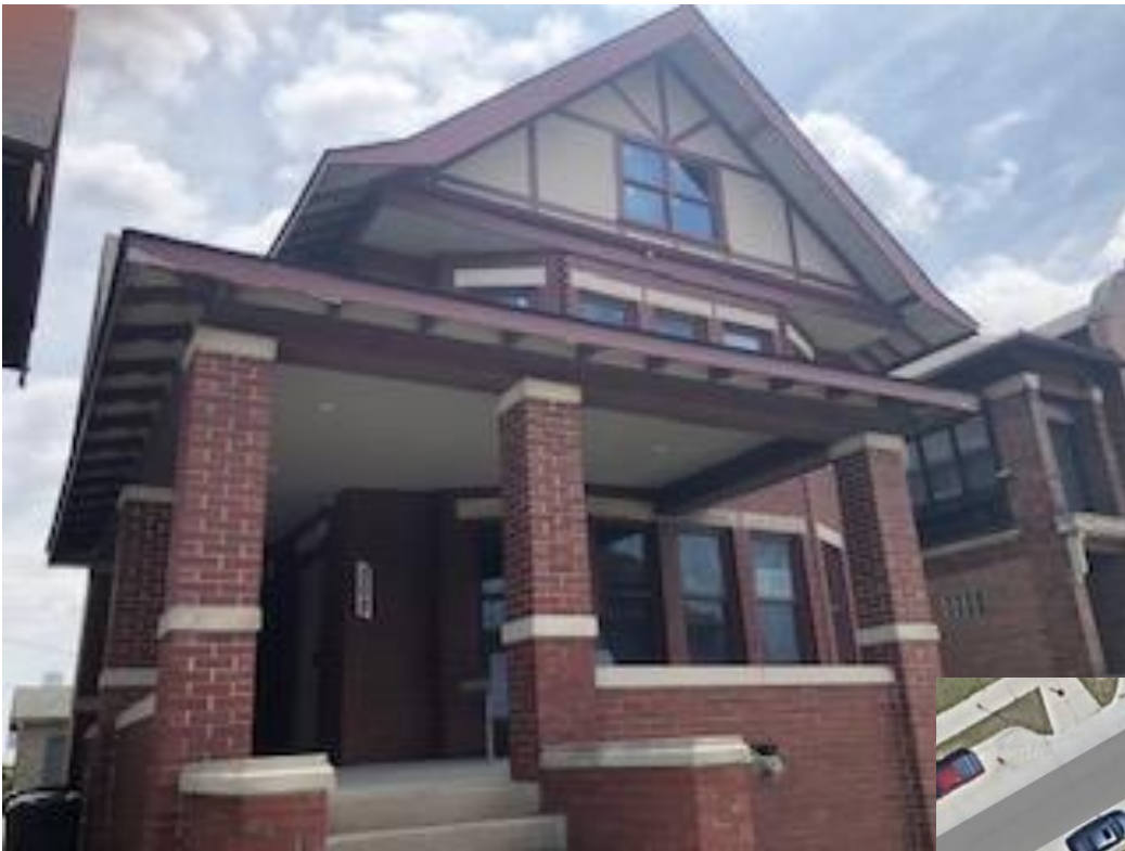
Above: 308 Eliot

There are many similarities between the neighboring houses, with staff identifying both as examples of Tudor Revival/Craftsman (an emerging style at the beginning of the 20 th century). Each house has a cross-gable; one is at the front (314), the other is at the rear (308). Carrying down from the cross gables are boxed out overhangs (314) or a double bay window (308). Side-by-side windows in gables that display half-timbering details, extended and elaborated rafter ends, exposed rafter tails, and deep porches with brick piers, create a cohesion between the two structures.