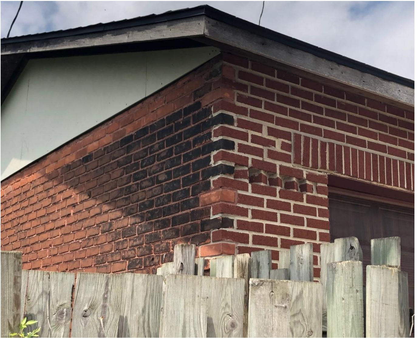
The entire west wall is original brick.