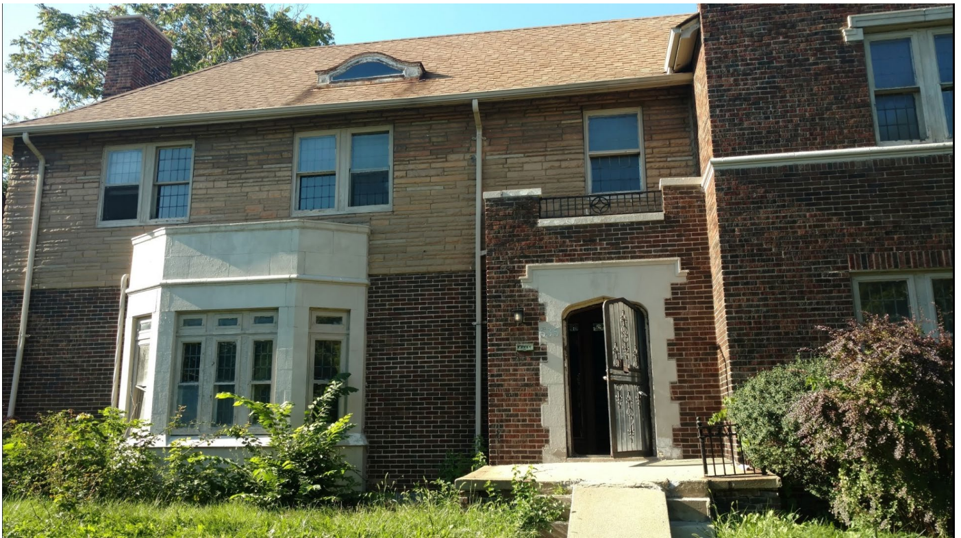
Figure 3: View of the façade windows prior to replacement.