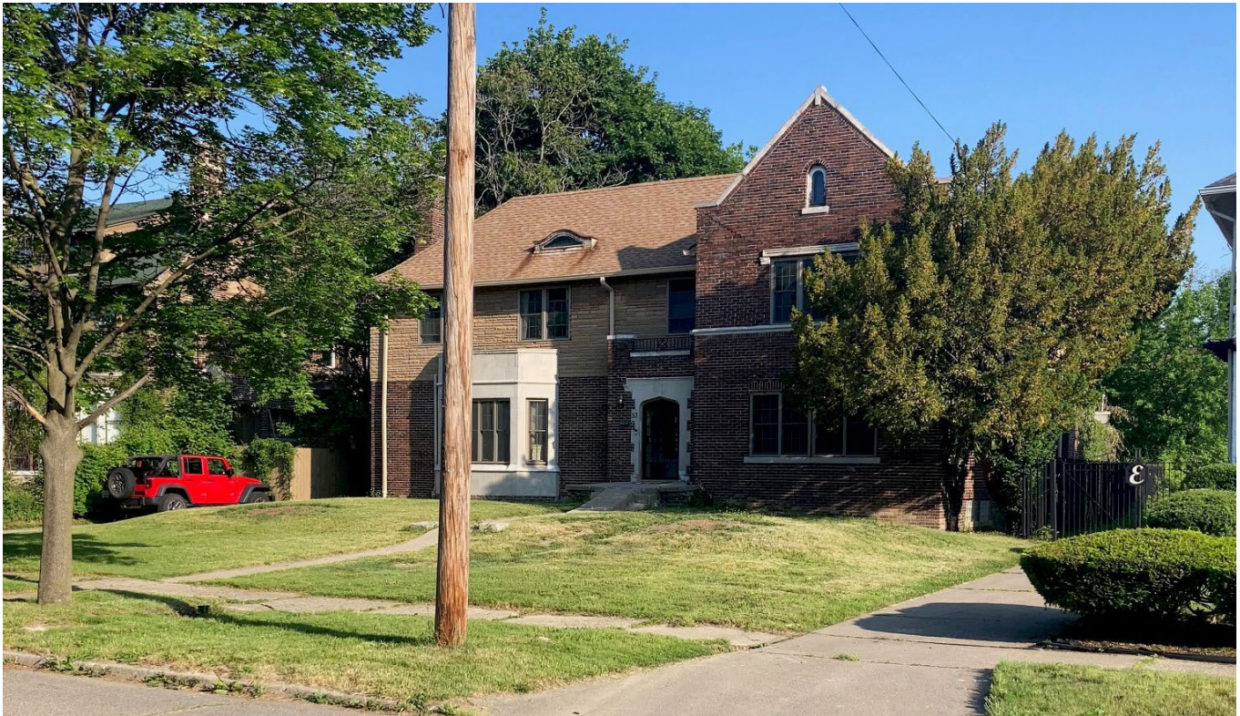
Figure 1: Current view of 535 Arden Park

The building located at 535 Arden Park Boulevard is a 2 ½-story dwelling that was constructed ca. 1922. The building is clad in dark brown brick and limestone. The asymmetrical façade includes multiple bays and projections with the front entrance located centrally on the elevation and articulated with a stone surround. The front door is accessed via an elevated porch. The cross-gable roof is covered in brown asphalt shingles features an eyebrow dormer on the front slope and an exterior brick chimney at the west end of the roof. Until recently, the building retained the majority of its historic wood windows (including many leaded-panel windows), however, the original windows were replaced with aluminum-clad wood windows without approval.