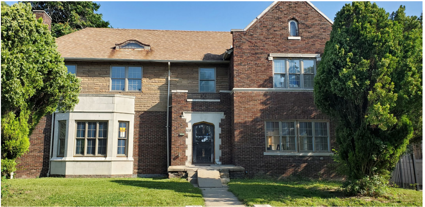
Figure 3: View of the façade windows after replacement.