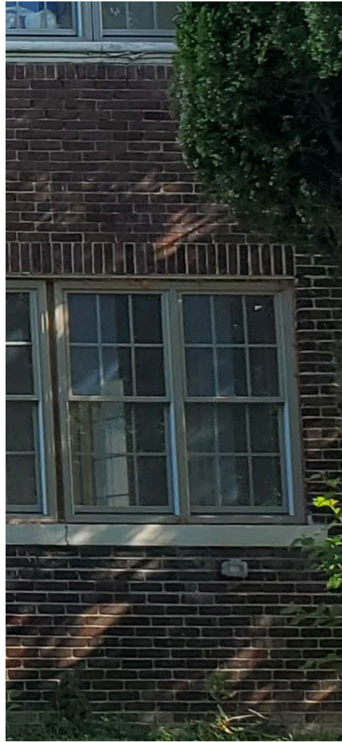
Figures 3,4: Photographs of the original windows (left), and extant replacement windows (right) on the side elevation of 535 Arden Park. The red arrow indicates the wood pieces the proposed project aims to replicate.