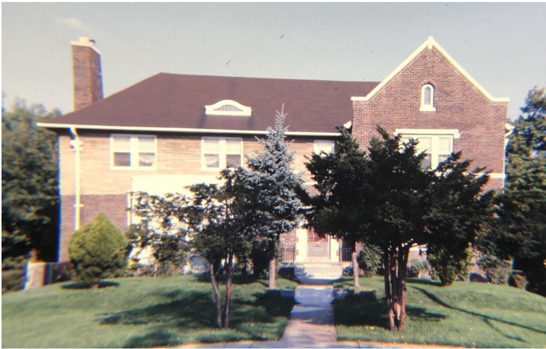
Figure 2: View of 535 Arden Park ca. 1981. HDAB