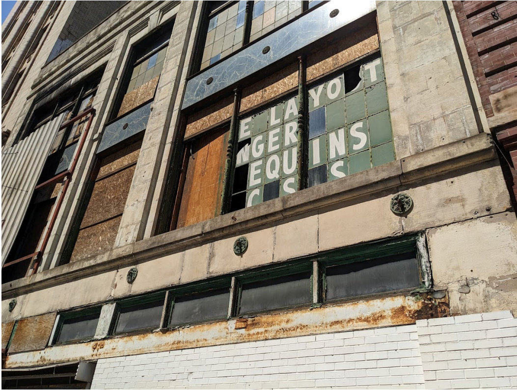
Detail view of the façade at 1332-1336 Broadway. Visible are the incorrectly treated mortar joints, evidence of water infiltration, and several historic elements (cast iron posts, medallions, stone panels) intended to be salvaged and reused.

In the introductory narrative letter to your Commission, the architect provides the following additional analysis: