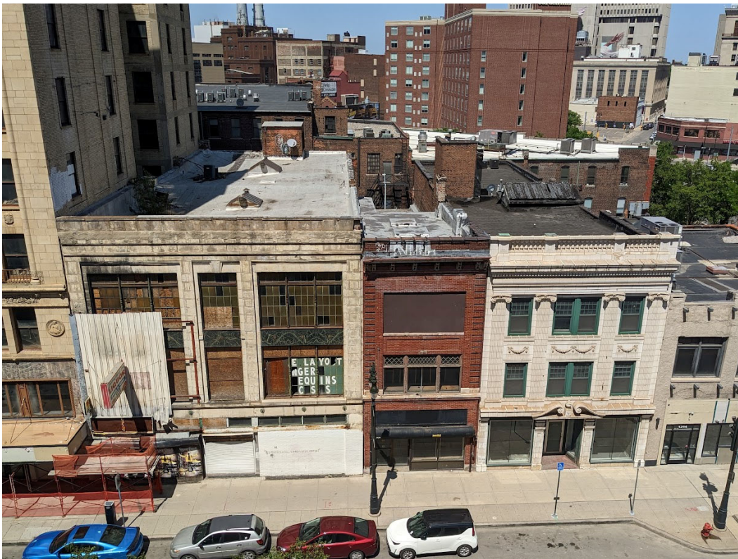
View of existing conditions at 1322-1336 Broadway, looking towards the east. Staff photo, May 31, 2023.

SCOPE: REVISION TO PREVIOUSLY APPROVED APPLICATION, APPROVAL EXPIRED; DEMOLISH BUILDING AT 1332-1336 BROADWAY, PARTIAL DEMOLITION AND REHABILITATE HISTORIC FACADES AT 1322 & 1326 BROADWAY, ERECT NEW MULTI-FAMILY BUILDING.