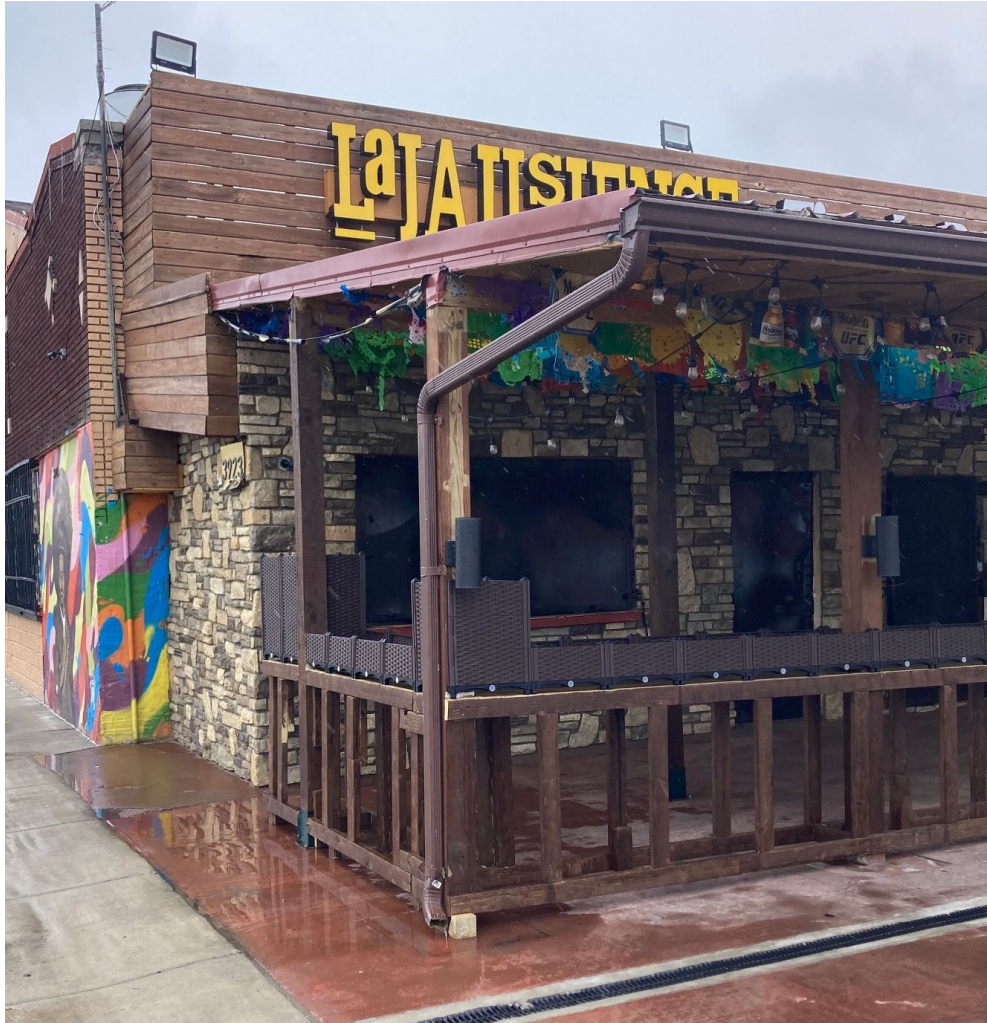
Figure 5: Detail view of the covered patio as constructed, looking southeast.