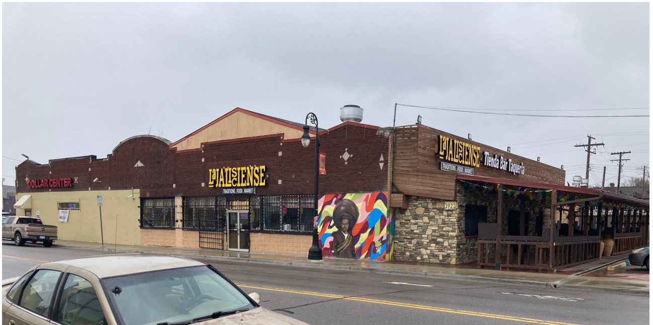
Figure 1: 3917-2923 W. Vernor Hwy., looking southeast.

The building located at 3917-2923 W. Vernor Hwy. is a former automobile repair facility that was constructed in two phases between approximately 1920 and 1940. The building was heavily altered during the late 20 th and early 21 st centuries with the construction of a gable roof over the western half of the building, the removal of all original windows and doors, and a complete renovation of the façade fenestration. The remaining character defining feature on the building is the gabled and arched parapet wall that features cast stone details and decorative brick banding typical of early-to-mid 20 th century commercial construction.