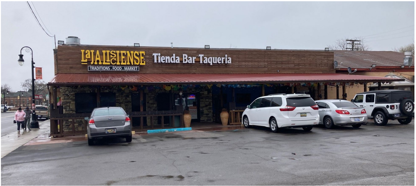
Figure 4: View of the shed roof patio area, signage, and parapet as constructed, looking east.