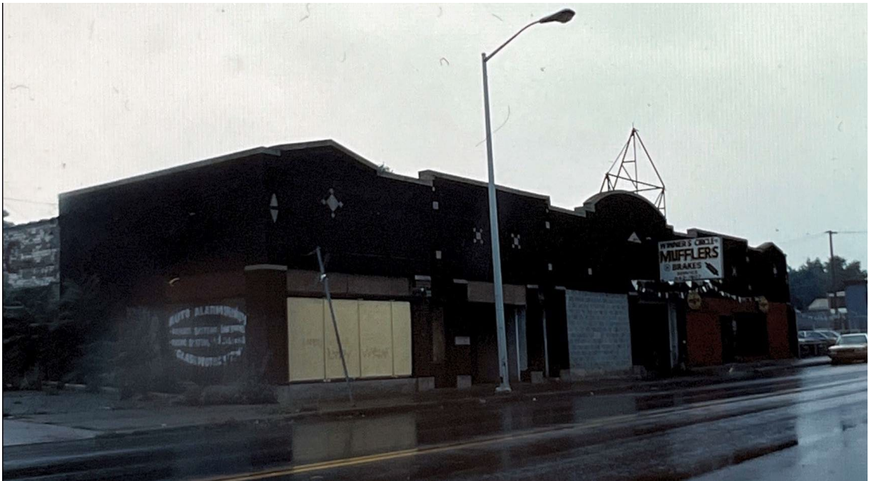
Figure 2: 3917-3923 W. Vernor Hwy. ca. 1993, looking southwest. HDAB