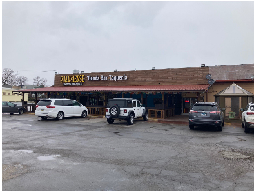
Figure 6: View of the covered patio looking northeast. Temporary gazebo is seen on the right side of the photograph.