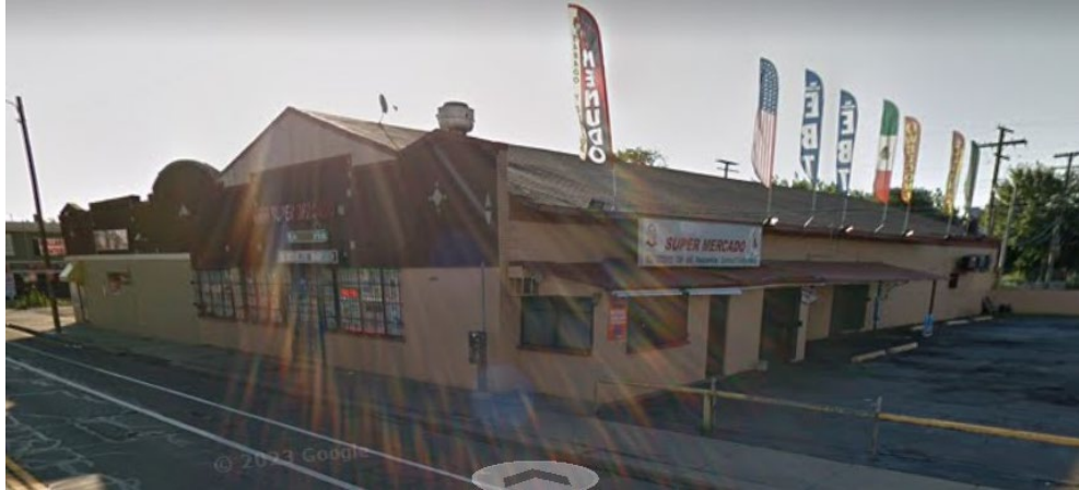
Images 7-9: Evolution of the western elevation, from top to bottom: 2009, 2013, 2015.