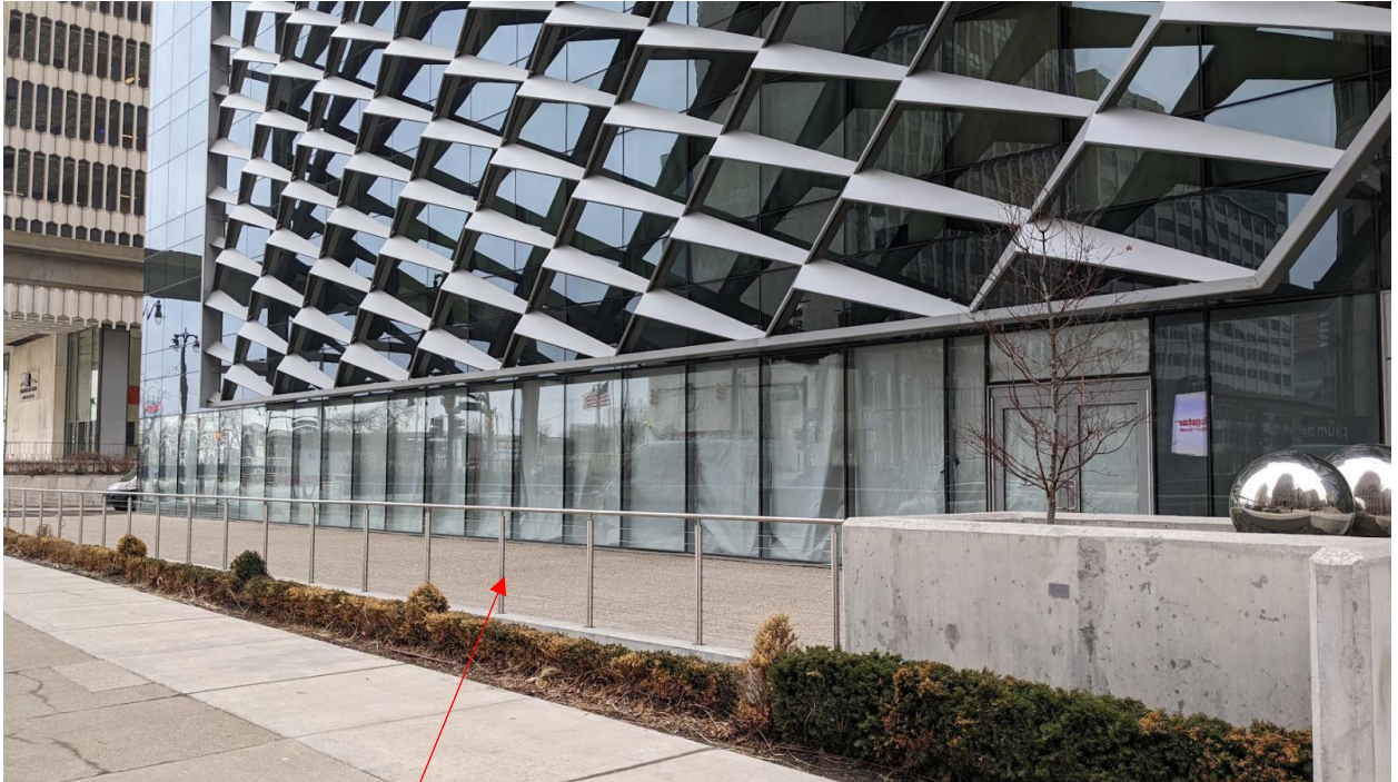
511 Woodward, current appearance (staff photo taken 3/3/2023). New outdoor patio to be established at this location/this 1/2 of the existing patio space