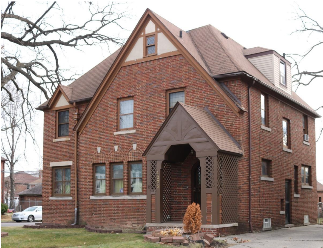
December 2022 photo by staff.

4205 Fullerton is a two-and-a-half story, brick house. It likely dates from the 1930s, though a construction date is not provided in public records. Tudor Revival or Neo-Tudor details include prominent gables, decorative timbering on the front (north) gables and projecting gable-roof front porch, brickwork in common bond with alternating Flemish courses, and leaded glass windows with horizontal and diagonal came patterns. The building is on the southwest corner of Fullerton Avenue and Petoskey Avenue with the rear (south) elevation clearly visible from Petoskey Avenue. Alterations include vinyl siding, and new windows on dormers, the apparent elimination of a door opening on the rear (south) elevation second floor, and rear (south) porch alterations as described below.