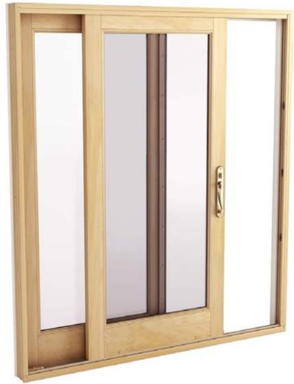
Ultimate Sliding French Door