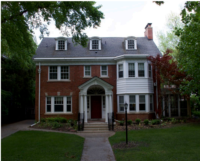
Figure 3: Current view of 2184 Iroquois

The applicant proposes to paint the non-brick portions of the dwelling a dark green color. The areas proposed to be painted include the wood trim on all elevations, the façade bay window, the screened side porch, front porch columns and trim, front door casing, all window casings, and garage door and trim. The applicant submitted a dark green paint chip from 2170 Iroquois, suggesting the window sash at that contemporary home was originally painted dark green.