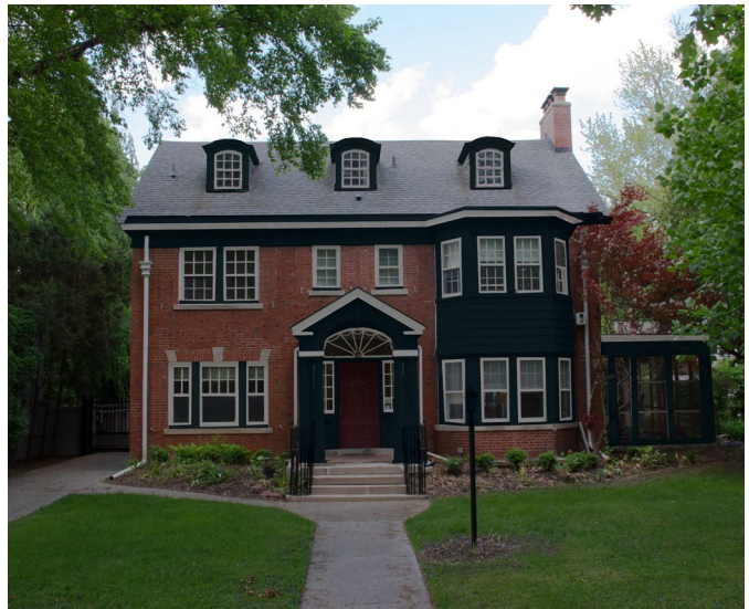
Figure 4: Rendering of proposed paint at 2184 Iroquois