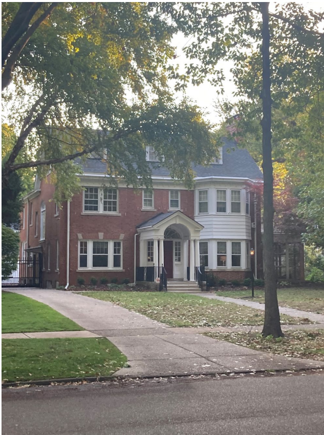
Figure 1: Current image of 2184 Iroquois.

2184 Iroquois is a two-and-a-half story, brick-faced dwelling constructed in 1919. The Colonial Revival building has a side-gabled roof with three segmental arch dormers. A two-story bay window projects from the southern bay of the façade. A screened porch is located on the southern elevation. The building features characteristic Colonial Revival details such as jack arch window lintels, a columned and pedimented front porch, and a front entrance flanked by side lights and surmounted by a Federal-style fanlight.