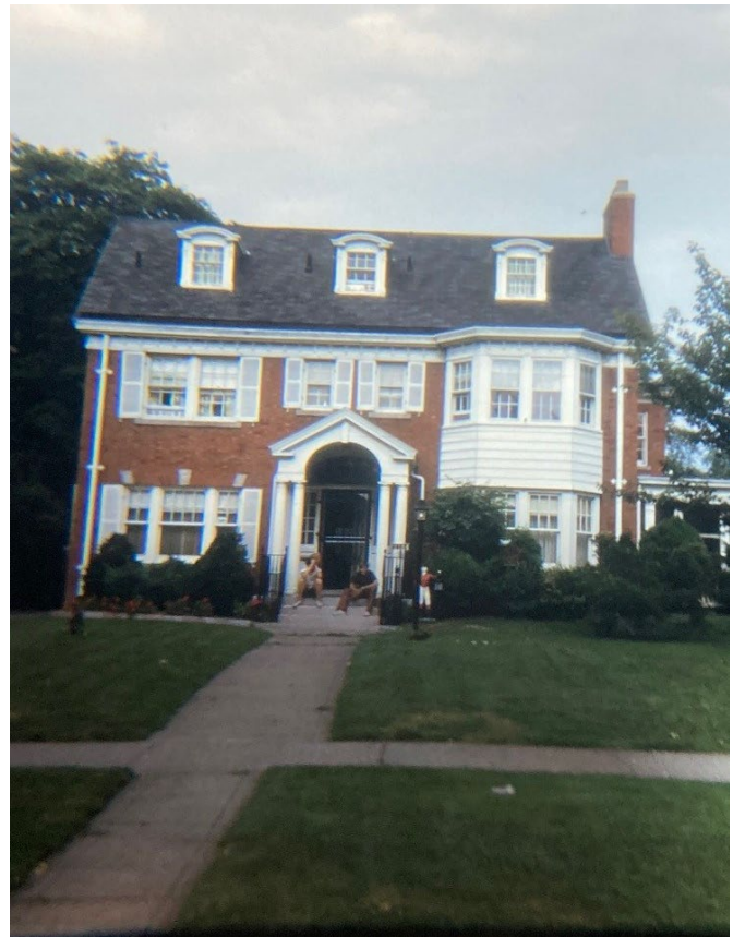
Figure 2: Image of 2184 Iroquois in 1970. HDAB