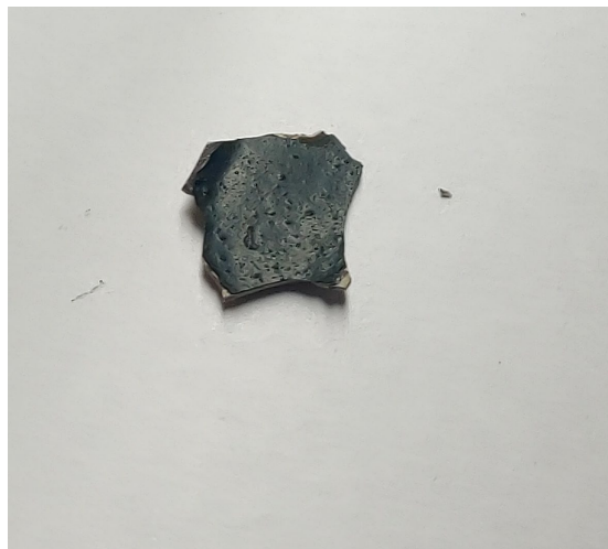
Figure 6: Paint chip submitted from the window sash of 2170 Iroquois.