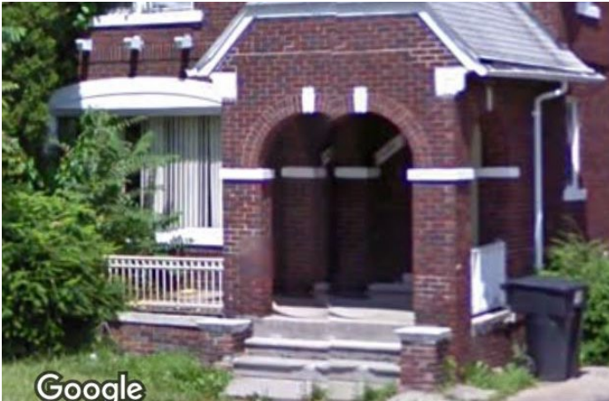
Site Photo3, Google Streetview August 2013: (South) front/side elevation showing original front porch railing, which was black, here painted white. Image quality is poor with double image line at center of porch archway.