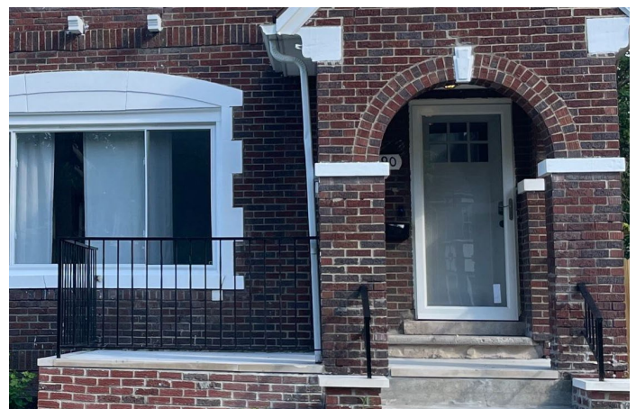
Site Photo 5, by Staff July 26, 2022: (South) front elevation showing new door with square windows.