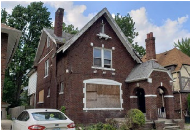
Site Photo 6, by Applicant, exact date unknown 2020: (South) front and side elevation showing condition of house after purchase.

The applicant states that they have completed work on removing an existing rear chain link fence and replacing it with a 6' wood panel fence that matches the next-door neighbor fence. The wood is pressure treated pine, with a dog-ear pickets. The fence is not proposed to be painted or stained.