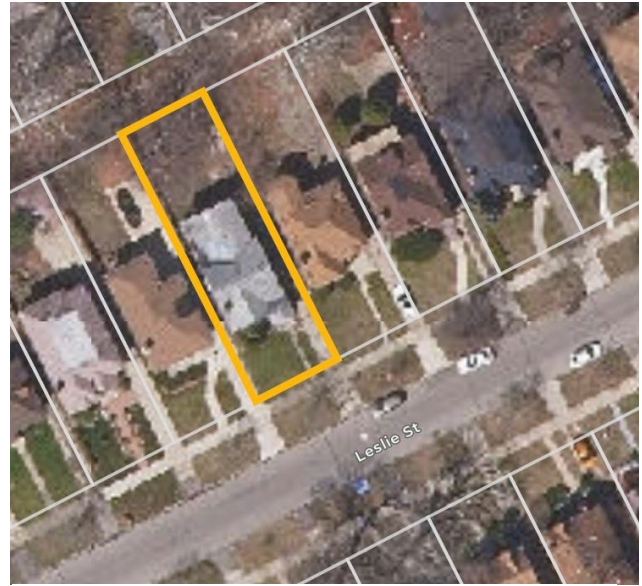
Aerial of Parcel #14004966, showing garage is missing.