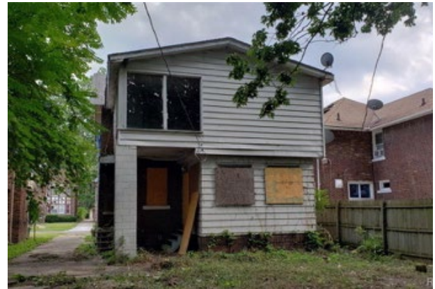
Site Photo 7, by Applicant exact date unknown 2020: (North) rear elevation showing condition of house after purchase.