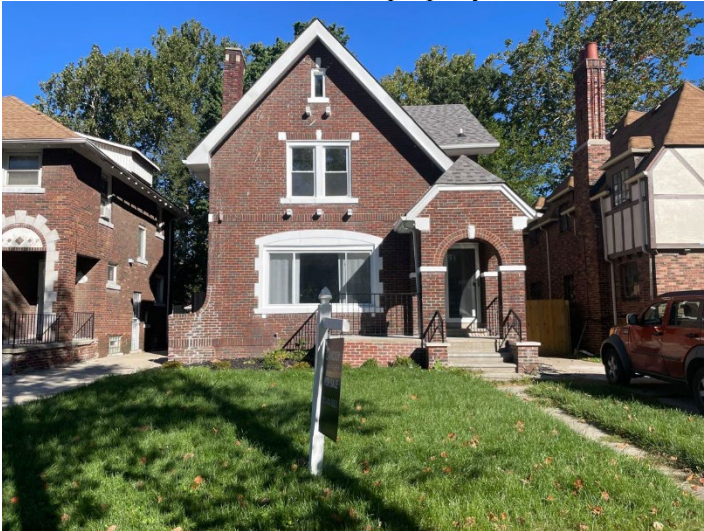
Site Photo 1, Sept.23, 2022: (South) front elevation.