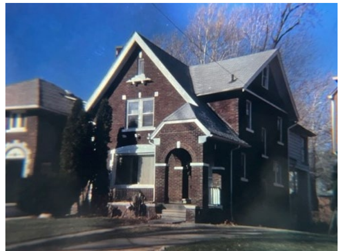
Designation Slide, 1999: (Southeast) front/side elevation original windows, porch, and painted cast stone.

This property has no HDC approvals on Detroit Property Information System (DPI), and has the following outstanding violations for work done without approval: