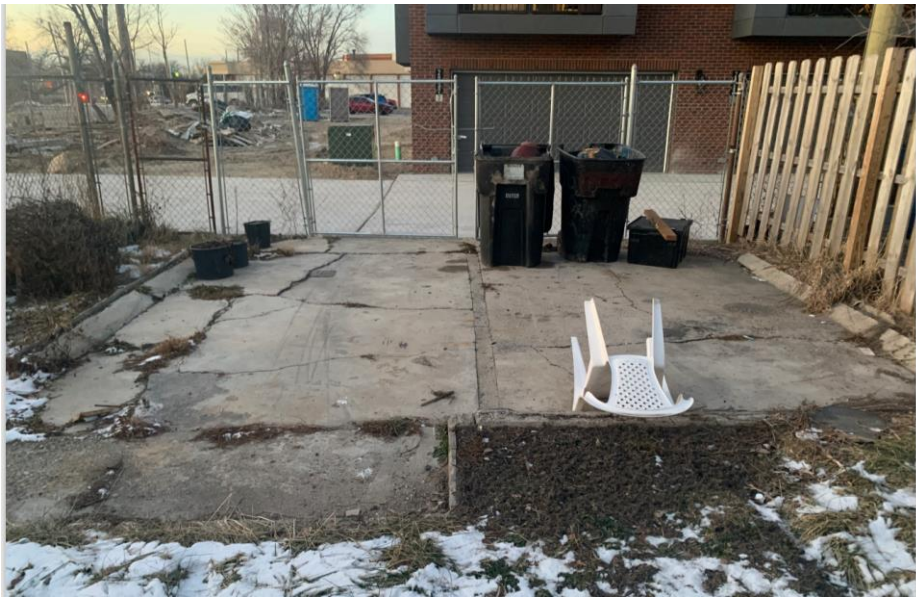
1830 Church, rear yard slab after garage demolition