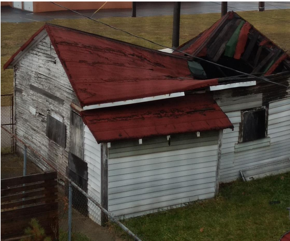
1830 Church, garage prior to unapproved demolition