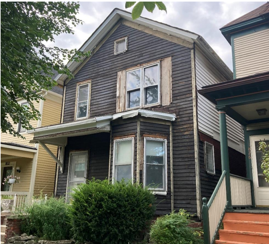
1830 Church, 9/1/2022 staff photo

The resource located at 1830 Church is a single-family dwelling which was erected ca. 1900. The front/southern/main mass of the home is two stories in height. Two, one-story additions which are to the south/rear of the home's main mass were erected sometime between 1900 and 1921. The building's side and rear exterior walls are clad with vinyl while the original wood clapboard siding is located at the front elevation. Windows are wood, double-hung and casement units. Non-historic aluminum shutters flank the windows at the front/south elevation, second story. A partial-width porch at the building's front/south elevation features a brick and concrete deck with metal railing. A hipped roof overhang with a non-historic metal awning shelters the front porch.