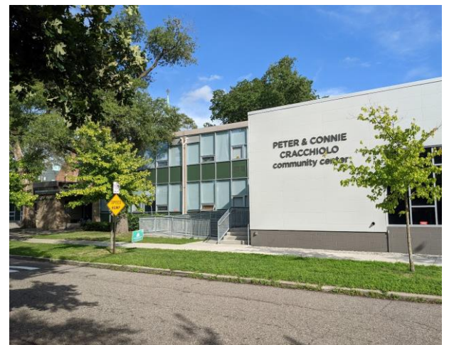
Current conditions, existing signage, staff photos taken 7/27/2022