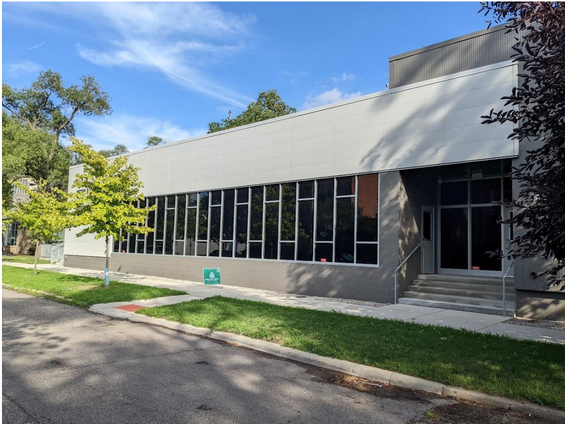
1221 Labrosse, current conditions, 7/27/2022 staff photos