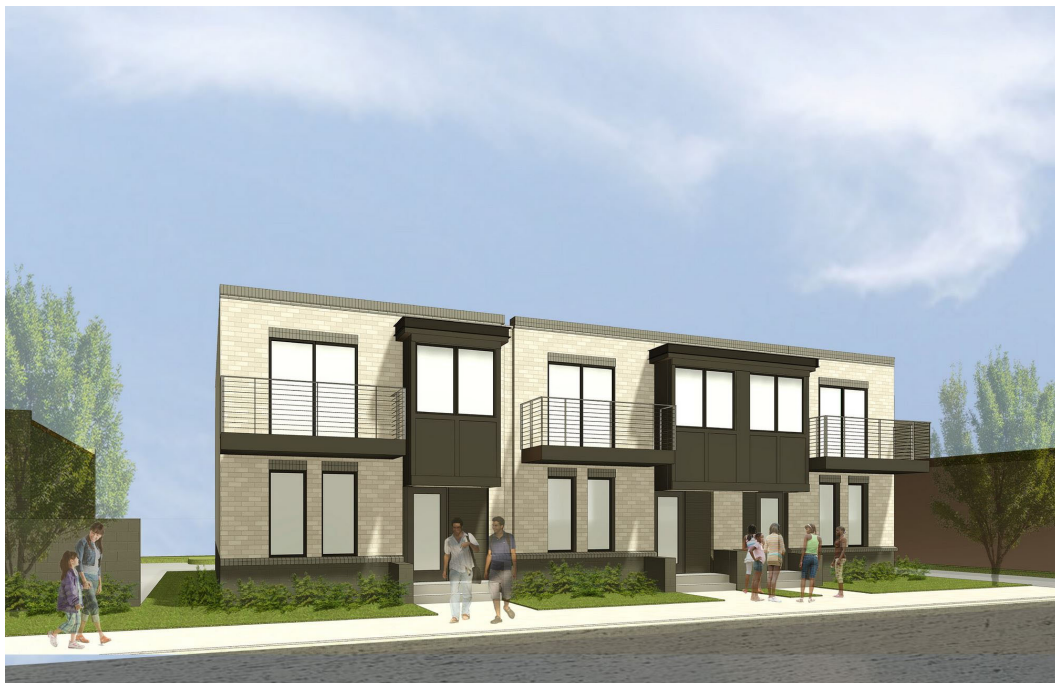
Applicant rendering – Porter Street