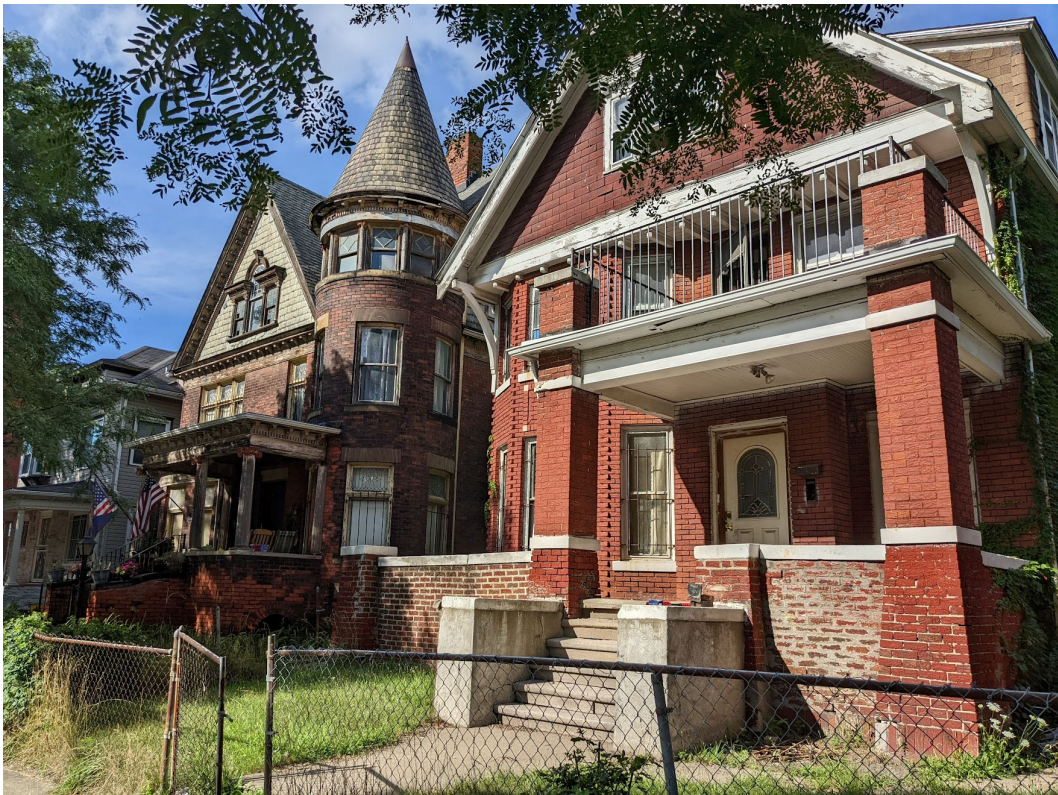
Historic context near West Grand Boulevard and Porter. Staff photo, July 27, 2022