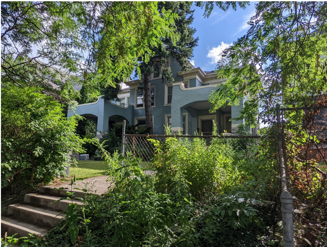
Historic context near West Grand Boulevard and Porter. Staff photo, July 27, 2022