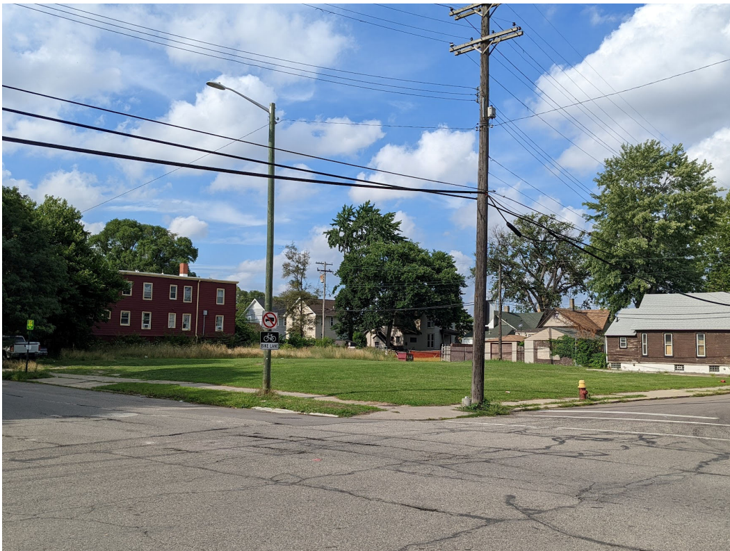
View of development site, looking northeast from West Grand Boulevard and Porter. Staff photo, July 27, 2022.

The subject site consists of seven vacant parcels owned by the Detroit Land Bank Authority (DLBA) and advertised for redevelopment via RFP in 2020. The parcels are at a prominent corner location, fronting on West Grand Boulevard, with a shorter side street exposure along Porter Street. The area is currently a grass-covered vacant lot, with some illegal parking/storage of personal vehicles apparent at the extreme northwest corner. This site was identified as an opportunity site (priority redevelopment site) as part of the West Vernor Planning Study completed in 2018.