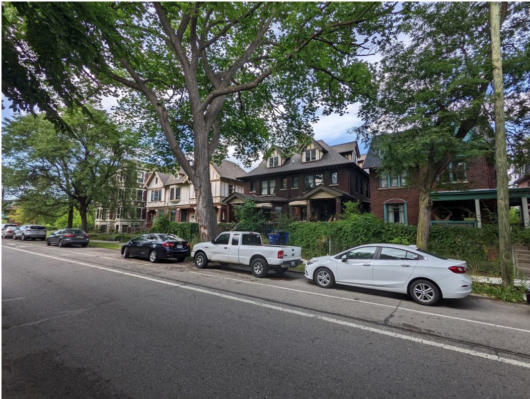
Historic context near West Grand Boulevard and Porter. Staff photo, July 27, 2022