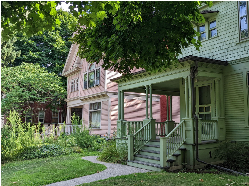
Historic context near West Grand Boulevard and Porter. Staff photo, July 27, 2022