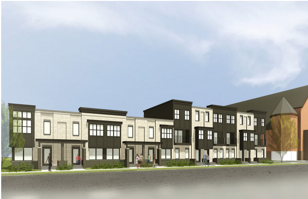
Applicant rendering – West Grand Blvd.

Per the submitted drawings, documents, narrative, and scope of work, the applicant is proposing to erect two new multi-family buildings, and a detached garage structure.