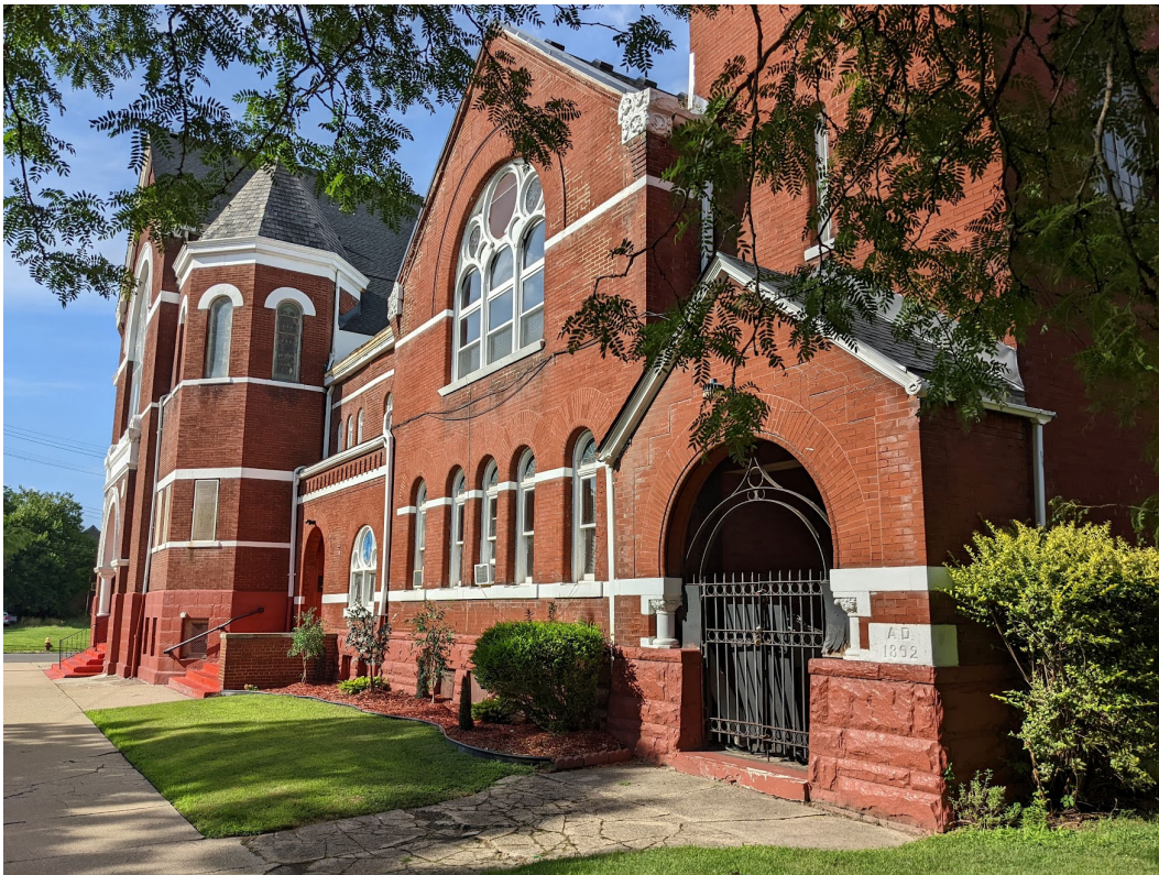
Historic context immediately across the street from site at West Grand Boulevard and Porter. July 27, 2022