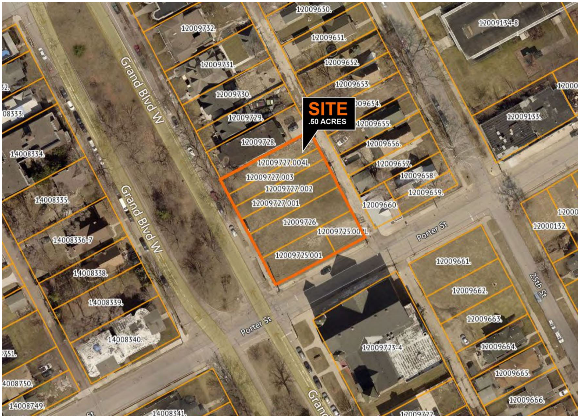
Subject development parcel outlined in orange, from original RFP.