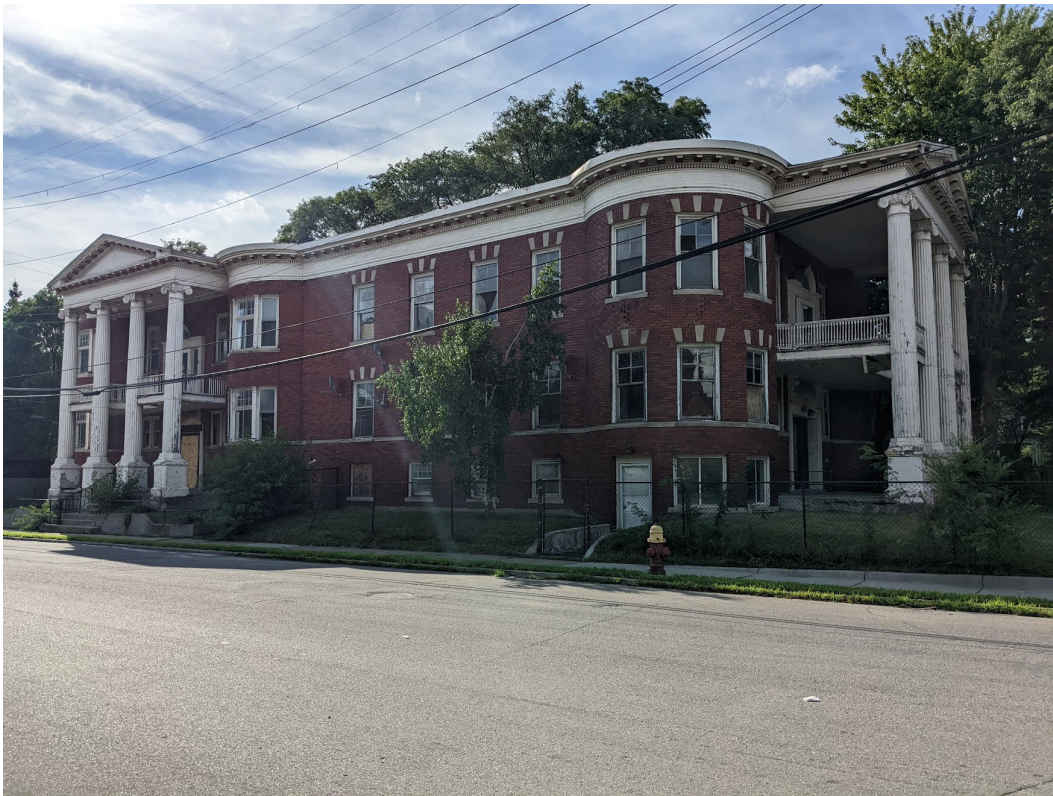
Historic context immediately across the street from site at West Grand Boulevard and Porter. July 27, 2022