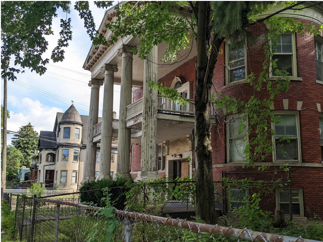
Historic context immediately across the street from site at West Grand Boulevard and Porter. July 27, 2022.