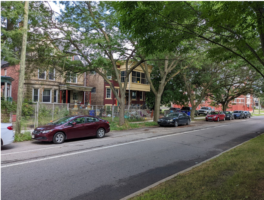
Historic context immediately adjacent to site at West Grand Boulevard and Porter. Staff photo, July 27, 2022