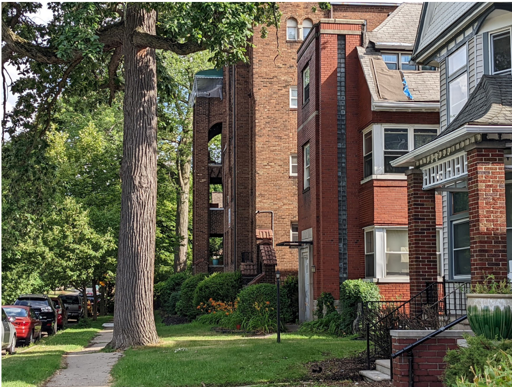
Historic context near West Grand Boulevard and Porter. July 27, 2022