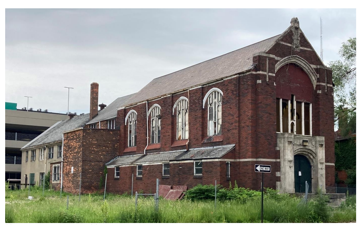
92 E. Forest, current conditions

The building located at 92 E. Forest is a church that was erected in 1915 to house the New Jerusalem (Swedenborgian) congregation. See the below Sanborn Map which indicates that the gabled-roof portions of the building and the side/east elevation, flat-roof wings had been erected by 1921. By 1950, the rear flat-roof portion of the building had been erected and the New Grace Baptist Church congregation had purchased the property. The northern mass/sanctuary has a slate roof while asphalt shingles are located at the rear, gabled-roof addition and the shed-roof, one-story additions at the east and west elevations. The material at the east elevation, flat-roof wings is an asphalt roll. Red brick clads the walls of the building's northern mass and the rear/southwest addition, while stucco walls are located at the southernmost rear gabled portion. The large fixed arched original windows at the building's sanctuary remain at the east, west and north elevations but are covered with wood panels. All other windows are 1/1, double hung wood units. The building's original, monumental front/north elevation doors have been removed and the opening has been enclosed with plywood. A single door has been added within the plywood. A masonry accessible ramp at the west elevation leads to a secondary set of paired, non-historic metal doors.