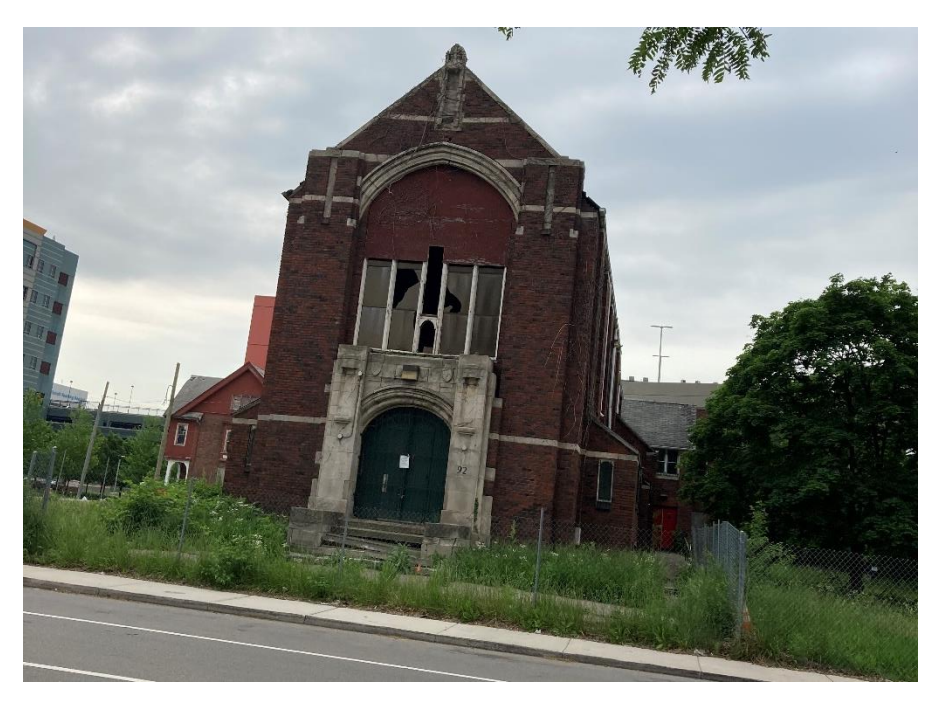
92 E. Forest, current conditions