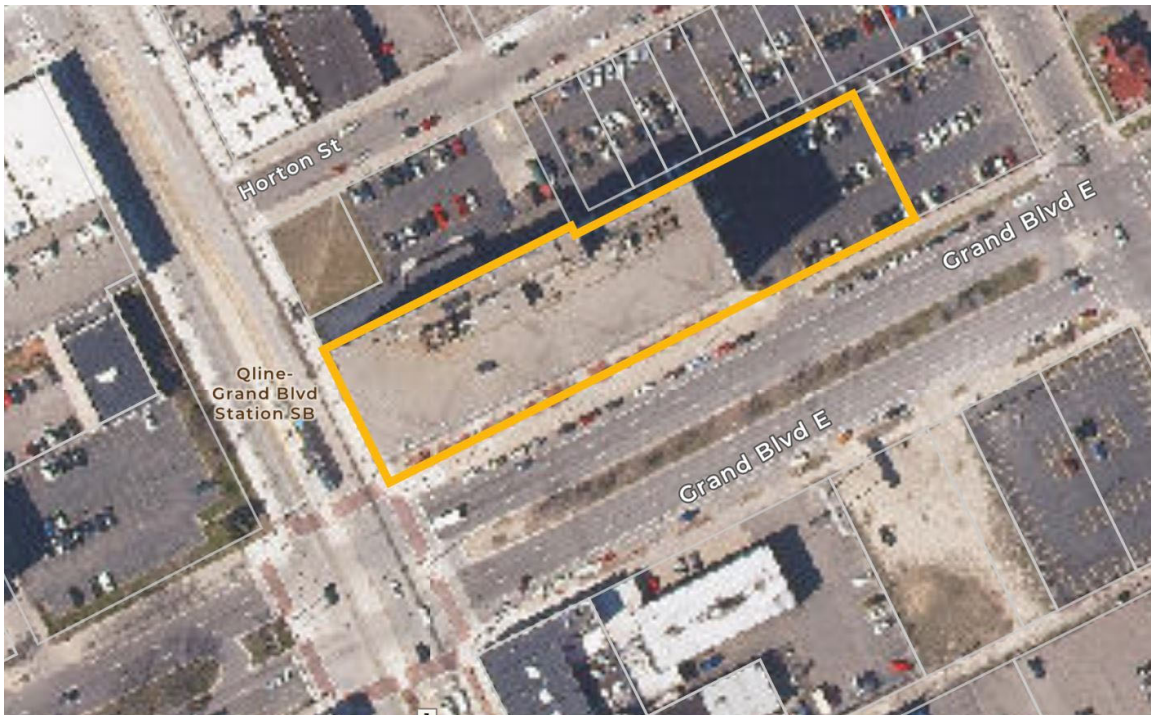
7300 Woodward outlined in yellow, per Detroit Parcel Viewer.

The building before its 1960s remodeling. The current mid-century design has now achieved significance in its own right.