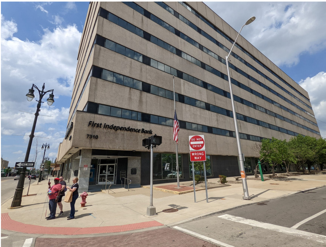
View of 7300 Woodward at East Grand Boulevard, looking north.

Originally the Ford Motor Company Sales Building, the building at 7300 Woodward was erected in 1910 and designed by architect Albert Kahn. In 1965, the State of Michigan, its owner at the time, notoriously stripped the original terra cotta detailing off the facades and rebuilt them in a late modern commercial vernacular, which survives today. The remodeling was designed by Kahn's successor firm, Albert Kahn Associates. Kahn's original interior public areas continue to exist but are not under the Commission's jurisdiction.