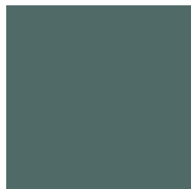
B:12 Grayish Green MS: 10G 4/2