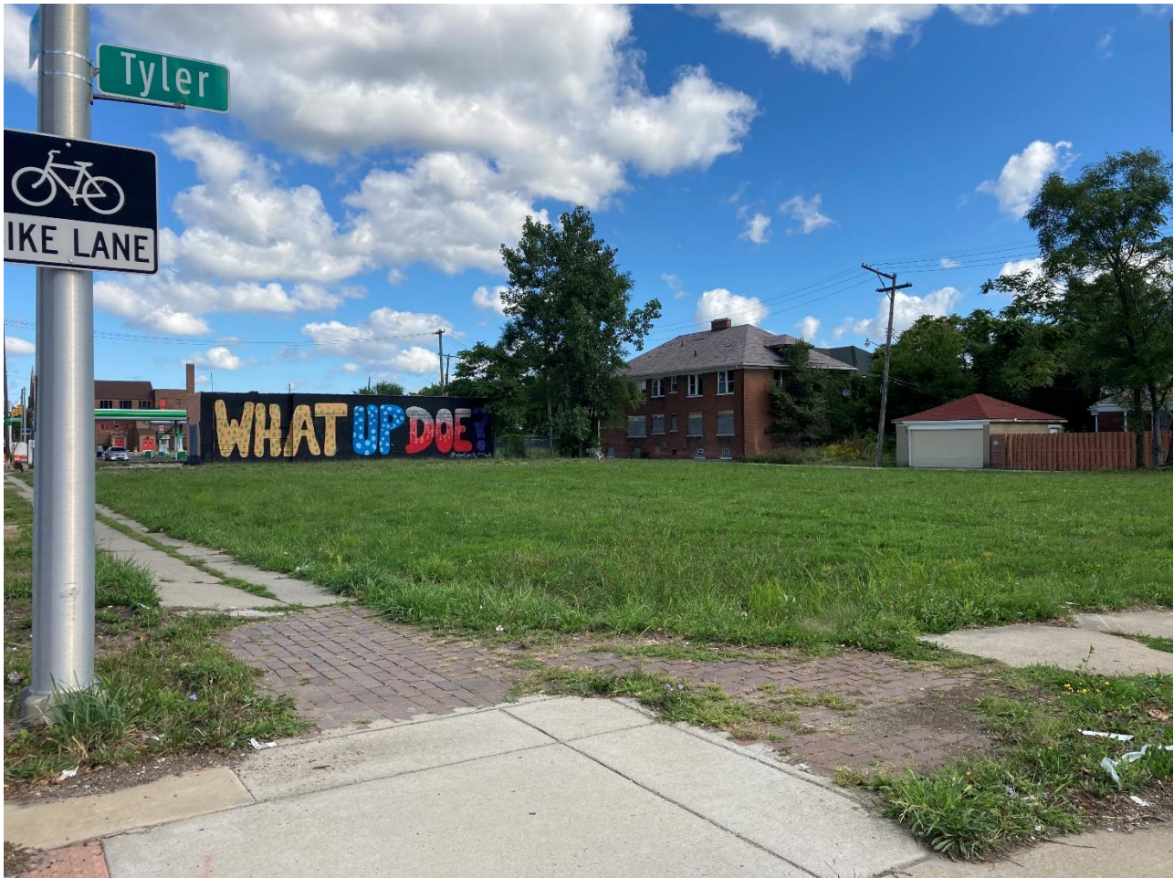
13200 Dexter, current conditions

The subject parcel is located in the Russell Woods-Sullivan Historic District, at the northeast corner of the intersection of Dexter Avenue and Tyler Street. Currently, 13200 Dexter Avenue is a vacant parcel which sits within a largely commercial setting. Specifically, ca. 1940s, one-story, flat-roof masonry commercial buildings are located directly to the north and west of the subject parcel. These buildings generally sit at a zero lot line/are located adjacent to the sidewalk. The parcel is currently owned by the City of Detroit.