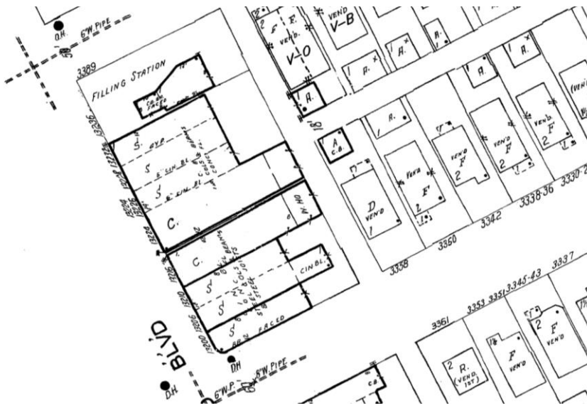
Sanborn Insurance Map 1971, east side of 13200 block Dexter Boulevard