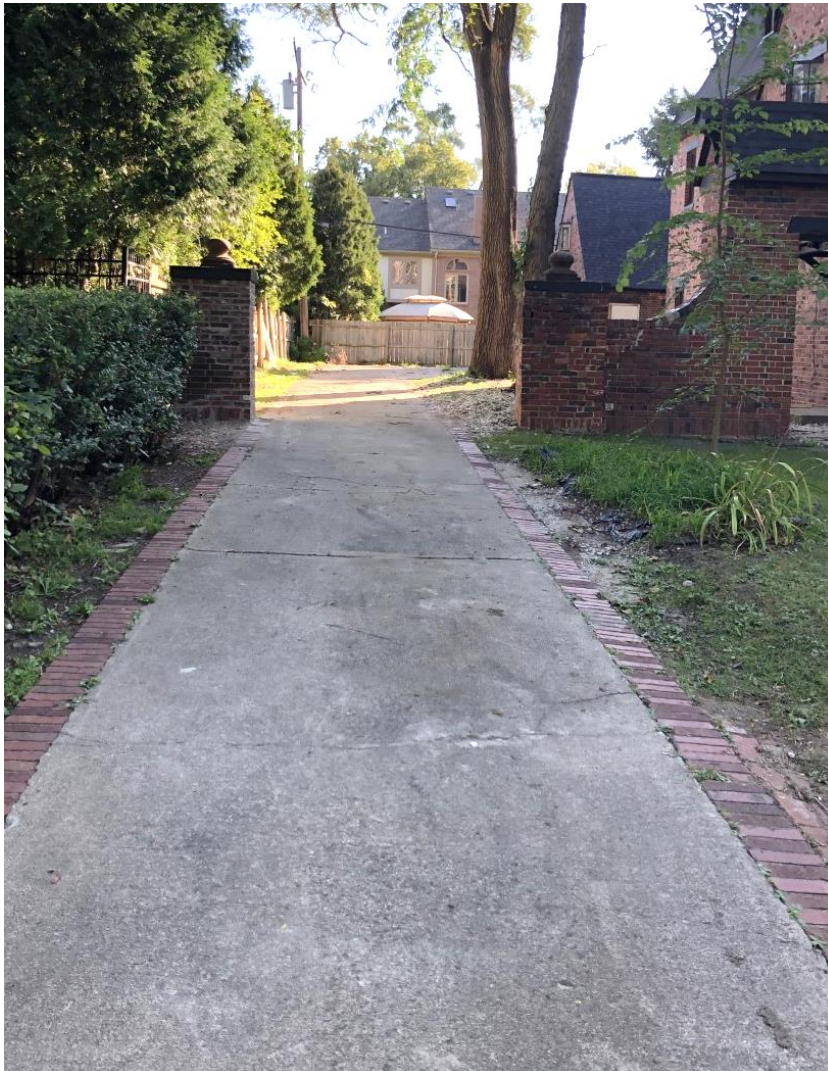
HDC Staff photo, September 1, 2021

9) New additions, exterior alterations, or related new construction shall not destroy historic materials that characterize the property. The new work shall be differentiated from the old and shall be compatible with the massing, size, scale, and architectural features to protect the historic integrity of the property and its environment.