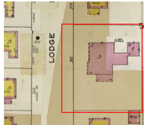
Right: Sanborn Map, Vol. 8, 1915-1951, Page 104