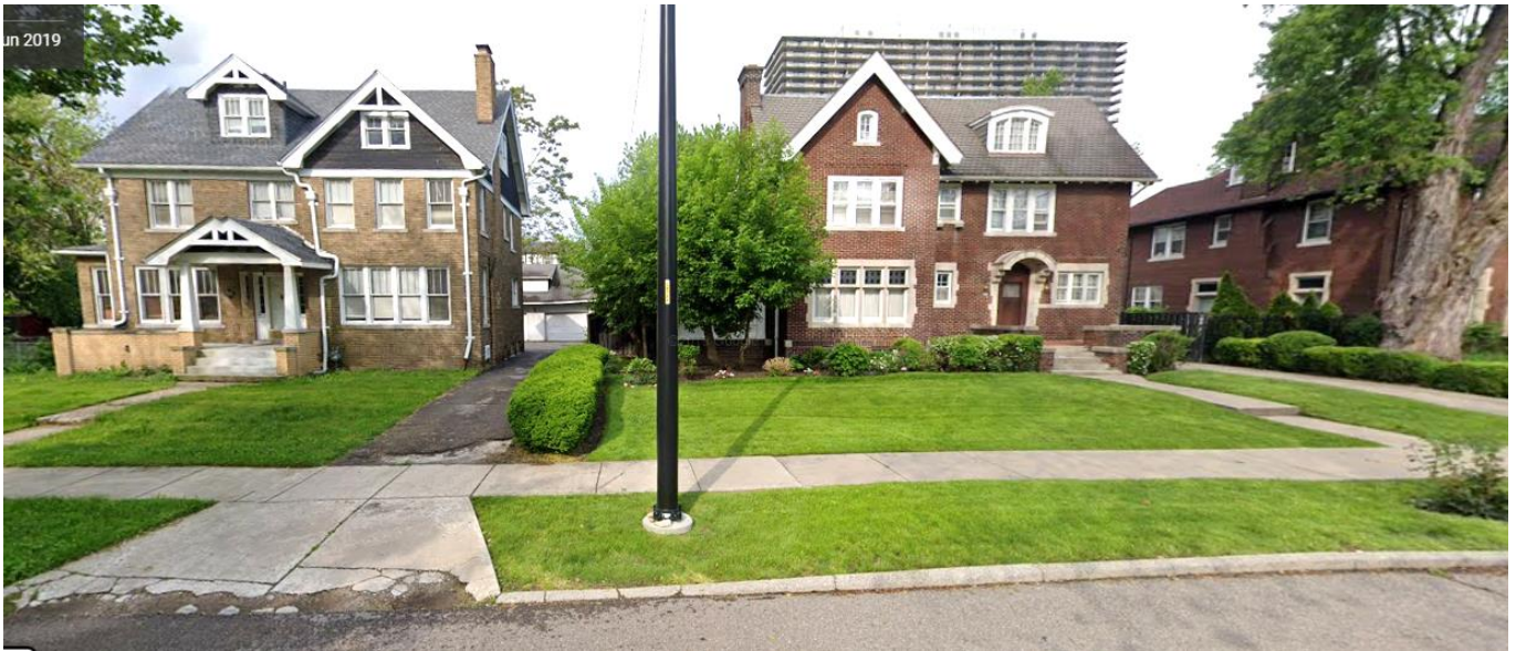
2019 Google Street View of HDC-approved asphalt (over concrete) driveway at left, approved in 2000.