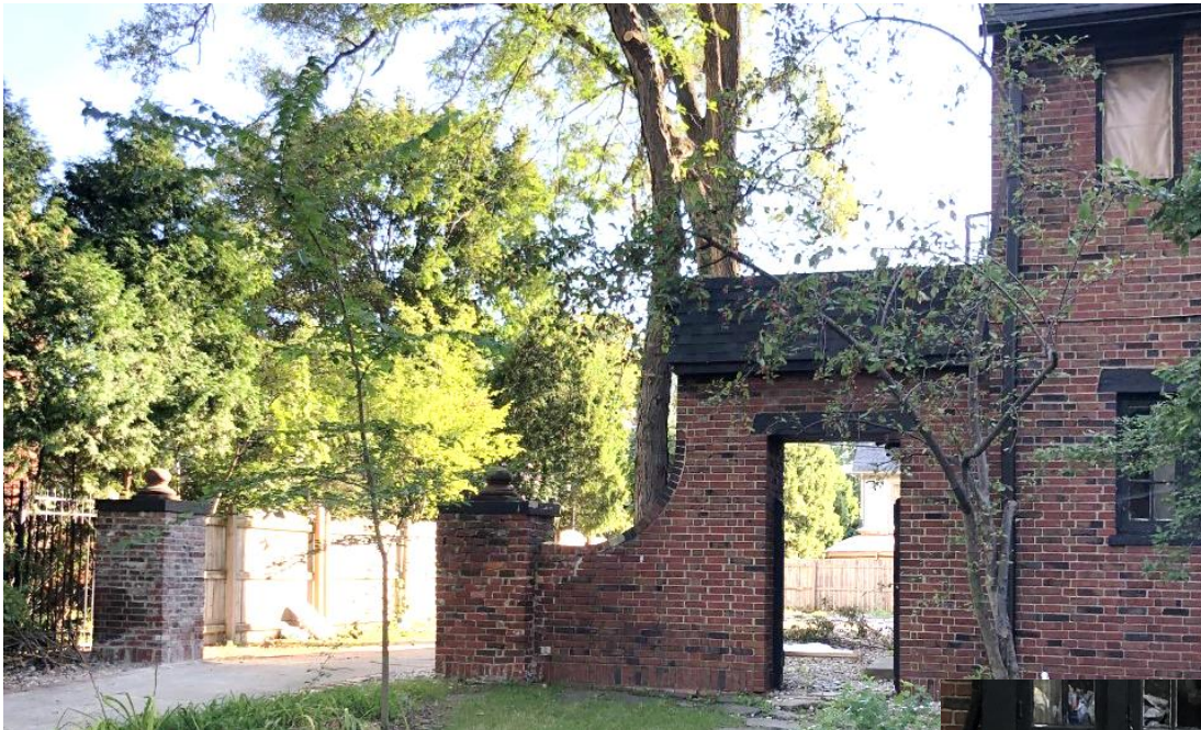
HDC staff photo, September 1, 2021. While the gate is not in place, staff noticed it laying nearby in the front yard.