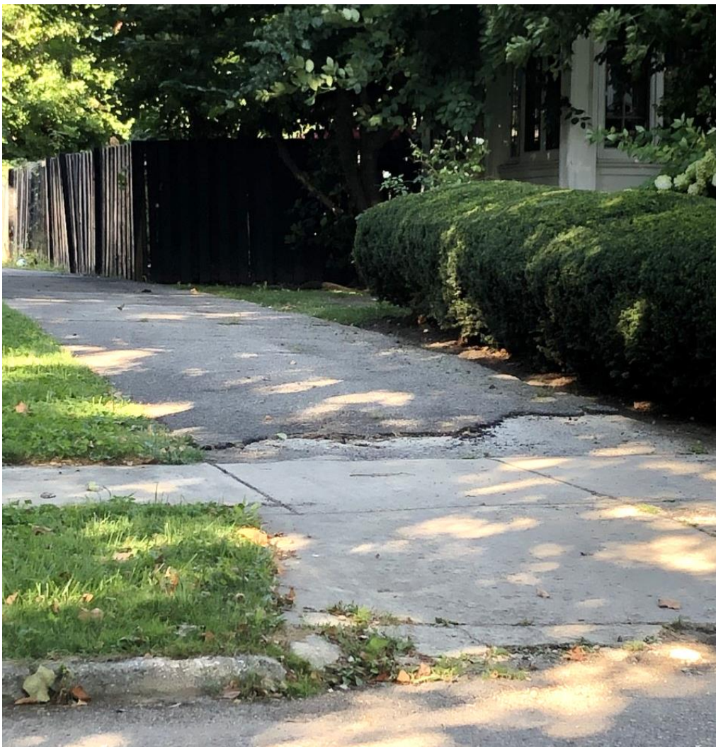
September 1, 2021