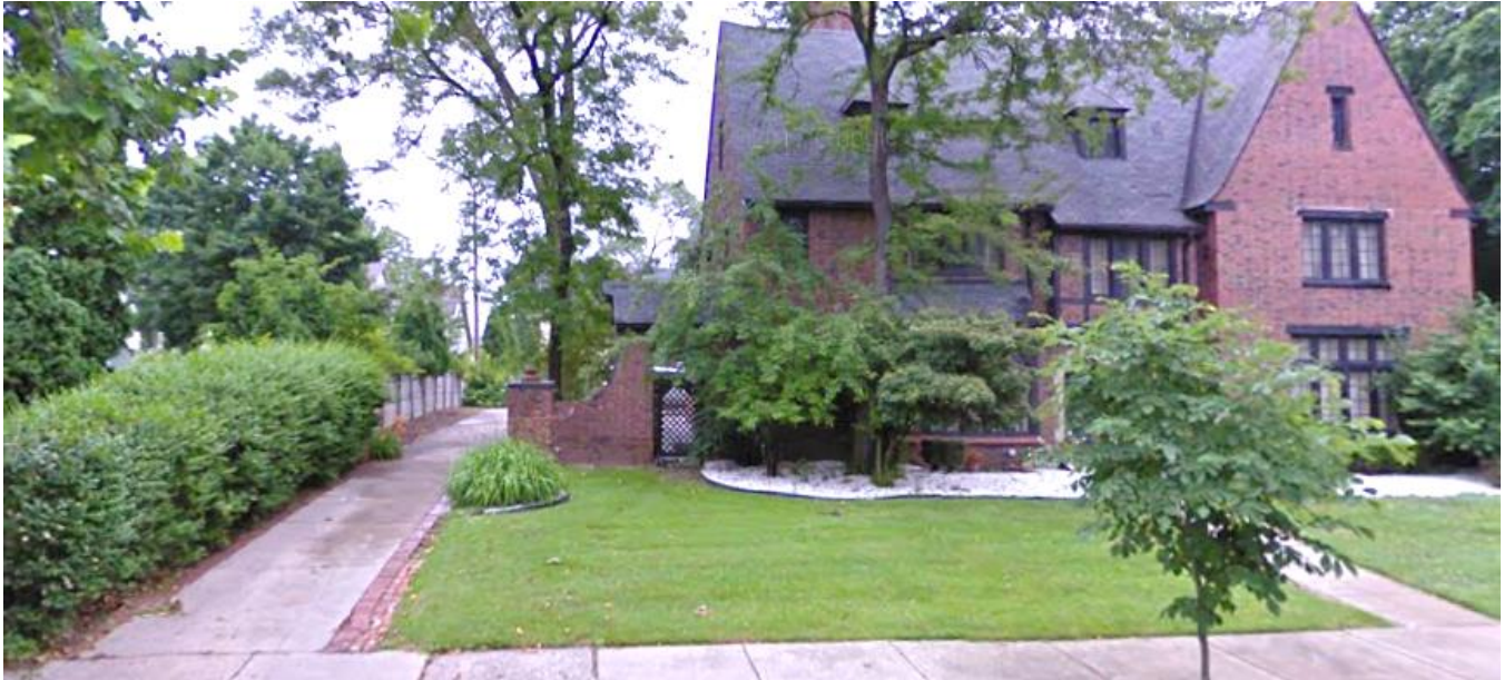
Google Street View, July 2009 – This picture shows the garden gate in situ. The left masonry pier is hidden by the hedge.

Bricks line the edges of the concrete driveway and front walkway. The drive is accessed from the street and is located close to the north-side property line. Due to the expansive lot, the space between the house and drive was finished with a masonry wall (with garden gate) that extends from the northwest corner of the house and terminates at a masonry pier abutting the driveway. An identical pier is on the other side, creating a formal entry to the rear driveway and garage (which is directly behind the house). At the rear of the house, the entire surface area between the house and garage is covered with concrete. The rear yard south of the garage and southern side yard are covered with sod; multiple large trees dot the landscape.