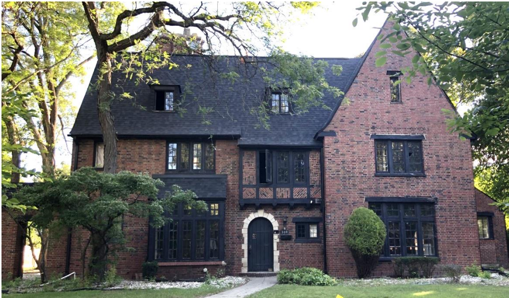
HDC Staff photo, September 1, 2021

The residential structure located at 360 Lodge was designed by architect Robert O. Derrick (later architect of The Henry Ford Museum). The date of construction listed on the building card is June 16, 1922 (garage is June 8, 1923). The three-story building sits parallel to the street; a tall, steeply pitched, full-height cross-gable punctuates the asymmetrical elevation. Variegated red brick is contrasted by dark brownish-black wood used for windows, mullions, rough-hewn lintels and sills, and half-timbers separating patterned brickwork.