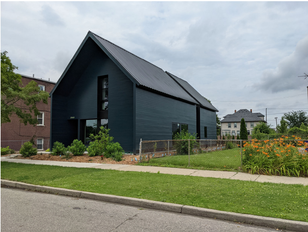
Wabash (street-facing) view of recent new construction house on site. Staff photo, June 30, 2021.