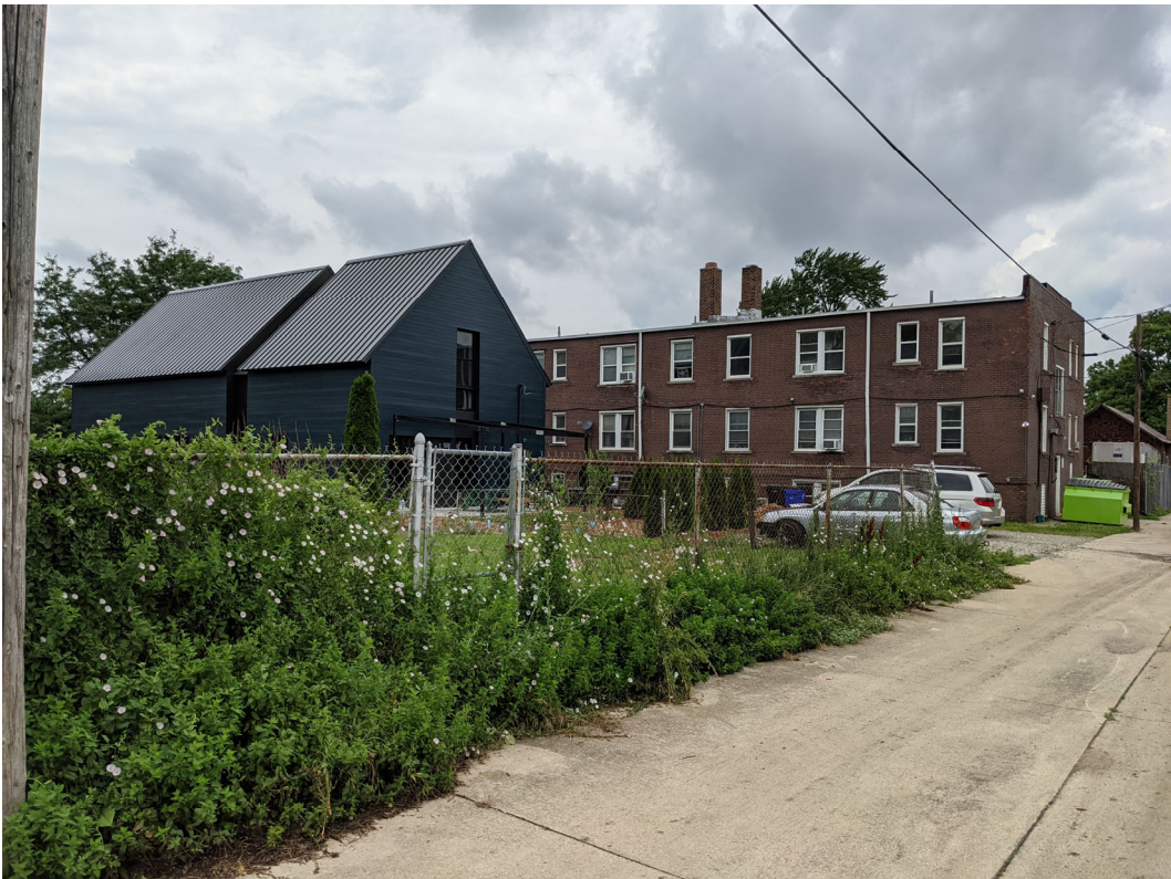
View of alley looking north, project site to left. June 30, 2021.