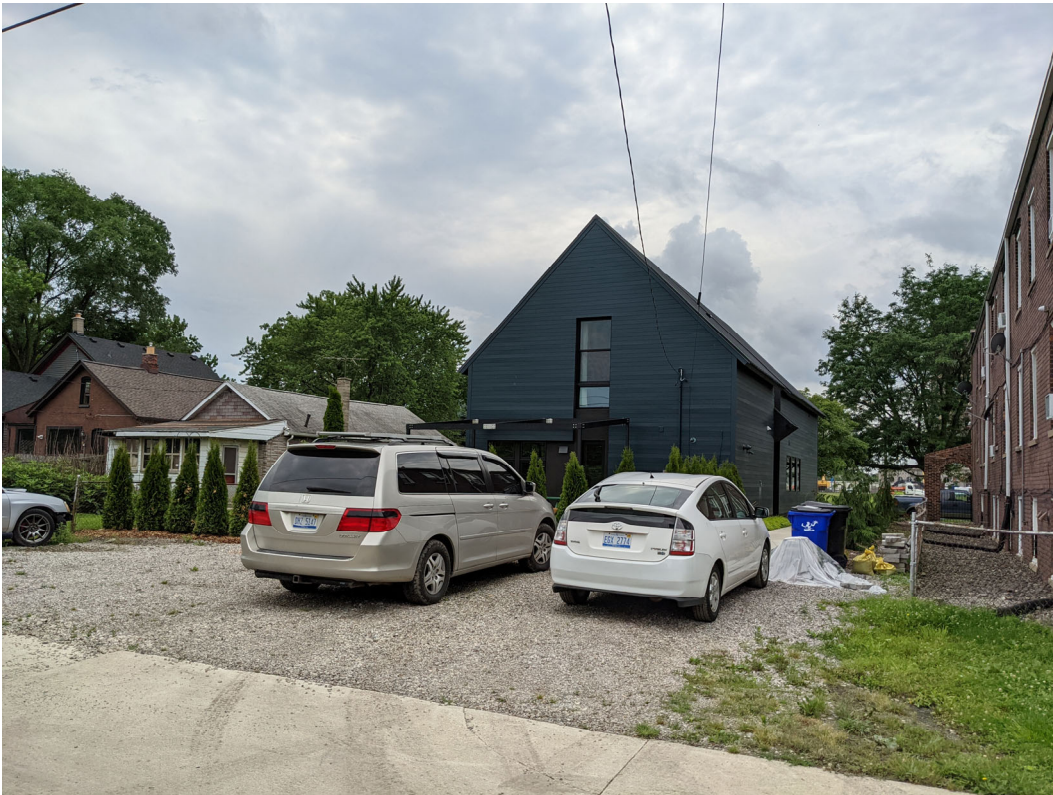
View of existing conditions at rear (alley) of 2060 Wabash, view towards the west, showing location of proposed accessory building. June 30, 2021.

The project site is at the rear of a recently built (2019) home approved by the Commission in 2017 for infill on what was a vacant lot. The parcel is on the east side of Wabash between Dalzelle and Marantette. The existing building is of contemporary design, with a deeply overhanging eave at the street elevation that extends from gable to grade, and clad with dark gray shiplap wood siding. The roof is steeply gabled and finished with metal, and is interrupted past the midpoint for skylights, which separates the overall massing into two distinct sections. Dark-trimmed windows, asymmetrically and sparingly arranged, complete the modern expression. The rear of the parcel is currently finished with gravel for parking of up to four vehicles, accessible from the alley.