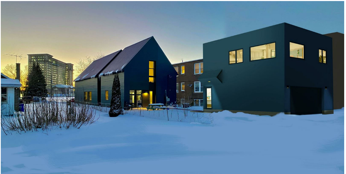
Rendering of proposed garage/carrriage house (right) on-site, from applicant's submission. Note the CMU wall is not shown here.

The overall expression of the proposed building is a minimally-detailed modernist building meant to complement and extend the vocabulary of the previously-built house.