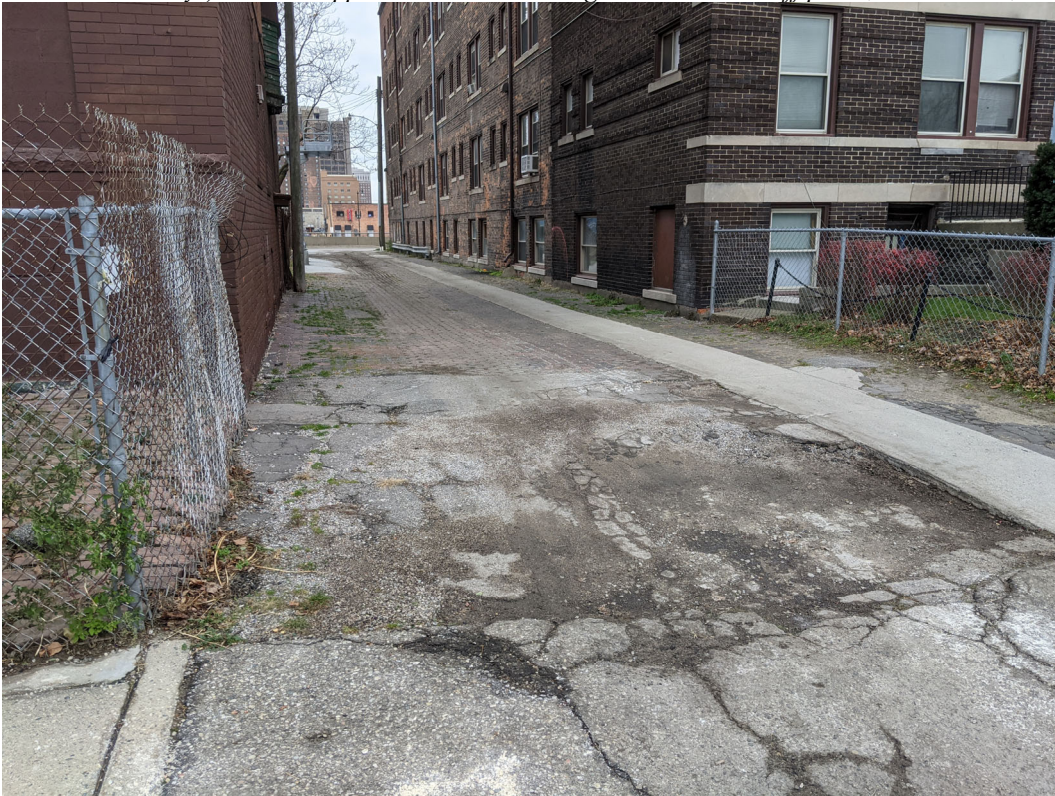
View of north-south public alley between The Henry and Bretton Hall, looking south. Note concrete strip running length of this alley. Staff photo, December 7, 2020.