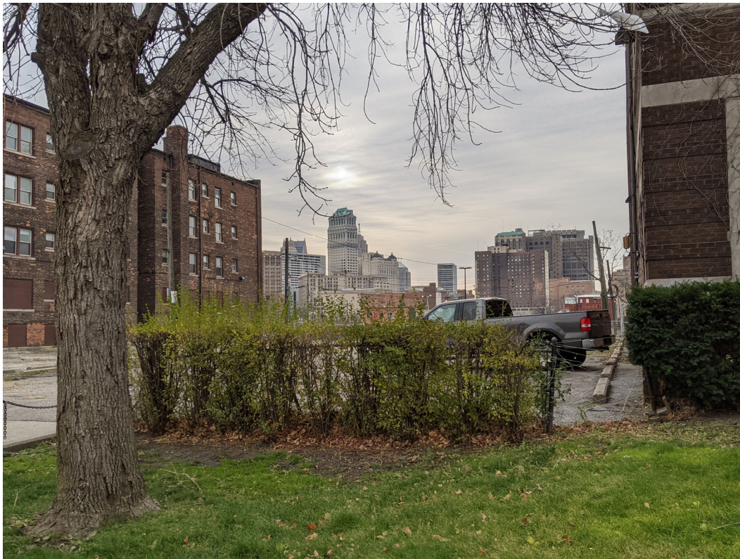
View southeast towards downtown at existing parking lots (481 Henry), Cass-Henry Historic District. November 24, 2020.

SCOPE: DISTRICT-WIDE SITE IMPROVEMENTS INCLUDING PARKING LOTS, OUTDOOR SPACES, STREET FURNITURE, LIGHTING, LANDSCAPING, TREE-PLANTING, PAVING, RESURFACING, FENCING, AND PLAYGROUND EQUIPMENT