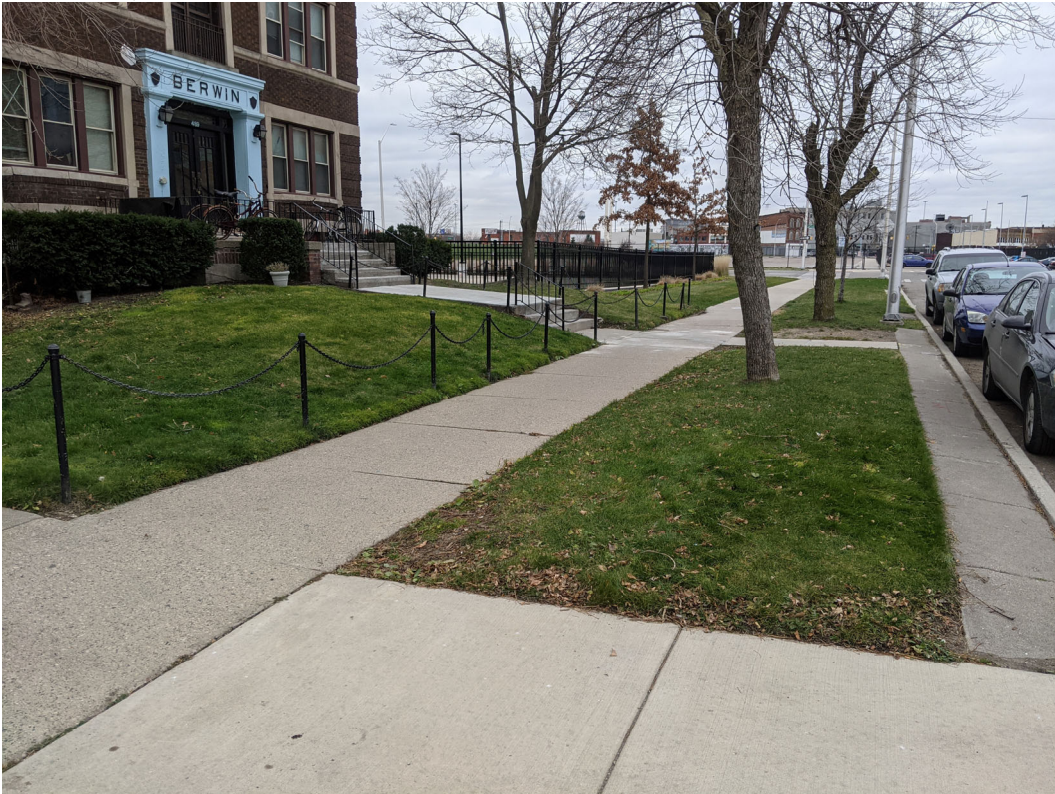
View of landscaping, sidewalk, fencing and various site elements in vicinity of the Berwin (489 Henry), looking west near the end of the historic district. December 7, 2020.