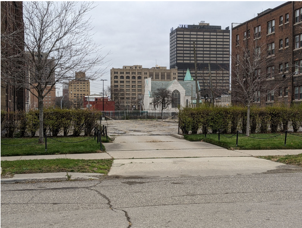
View of landscaping and curb cut/driveway to 467-469 Henry parking lot. Staff photo, December 7, 2020.