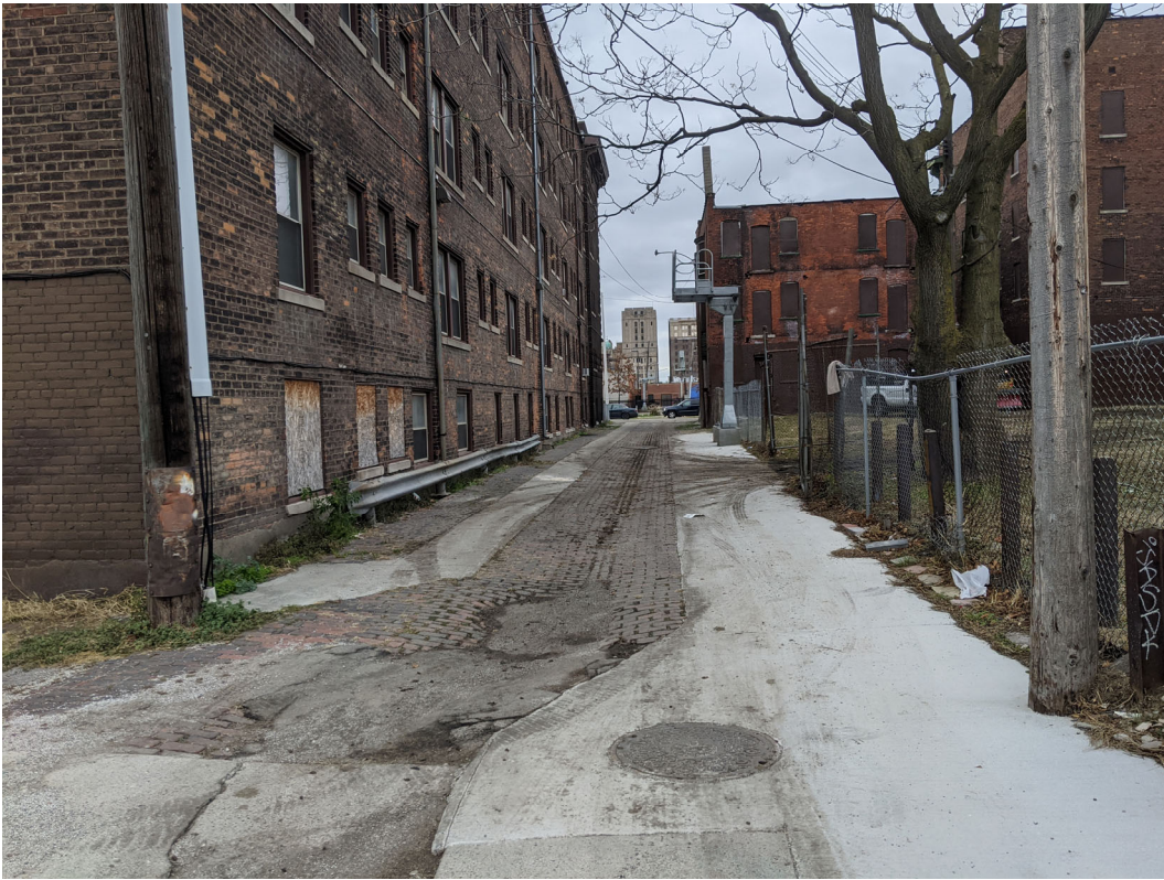
View of north-south alley, looking north. Most of this alley is in the historic district. Bretton Hall at left. Staff photo, December 7, 2020.