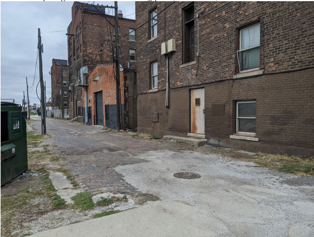
Reverse view of east-west alley, looking west. The historic district boundary runs along the centerline of this alley.. Staff photo, December 7, 2020.