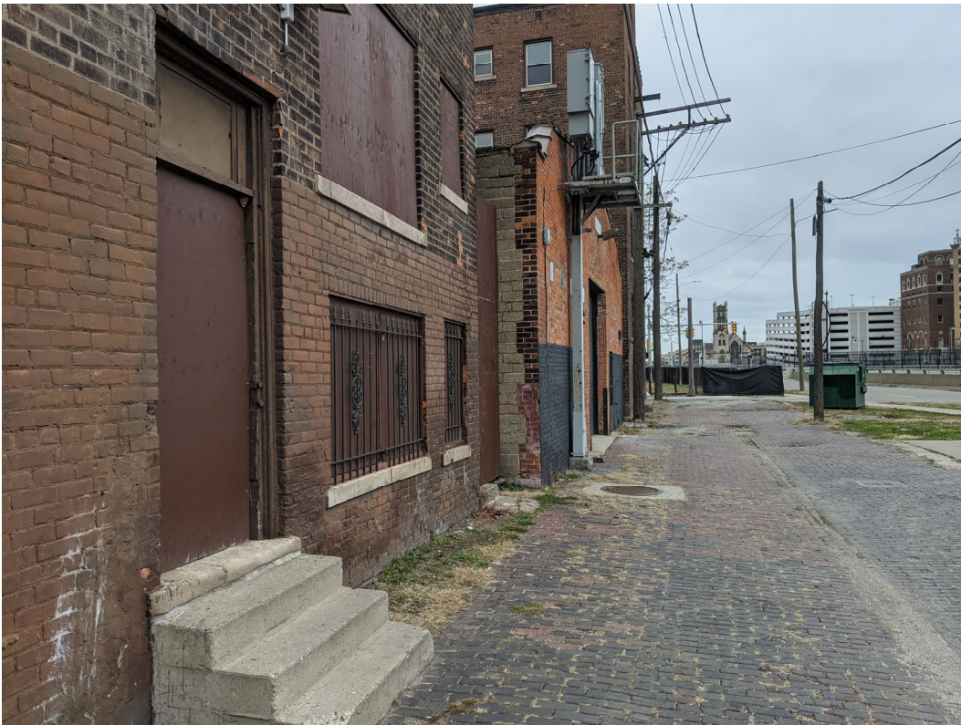
View of east-west alley behind the Claridge and 447 Henry, looking east. Abundant and reasonably sound historic brick paving exists in this location. December 7, 2020.