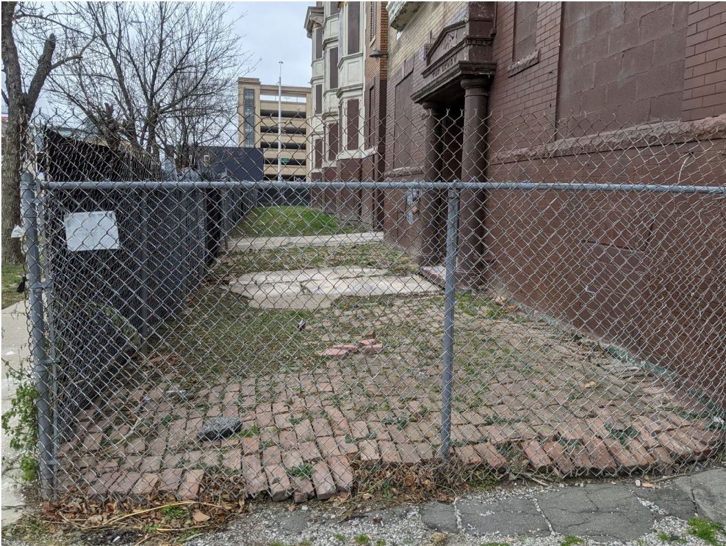
View of conditions in front of The Henry (foreground) and the Atlanta (beyond). This paving brick (as opposed to that in the alleys) does not appear to be a historic-age installation.