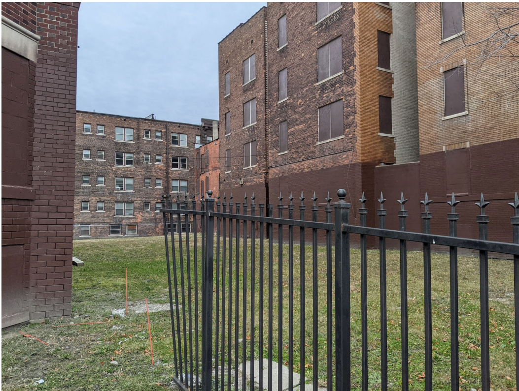
View of vacant lot at 2457 Cass, view to the west. South elevation of the Atlanta Apartments dominates the right side of this image. November 24, 2020