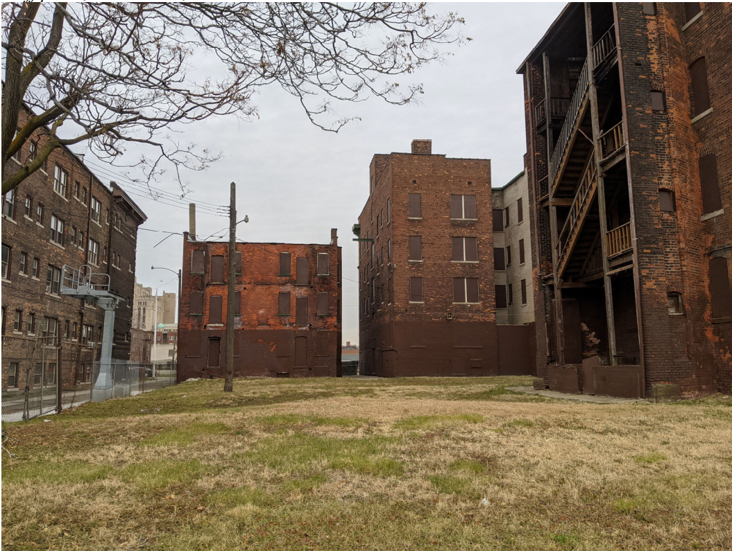
View of open space behind 427 Henry, center, and 2447 Cass, at right. Staff photo, November 24, 2020