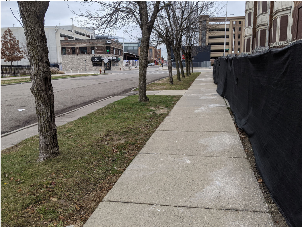
View of Henry Street trees towards Cass. Staff photo, December 7, 2020