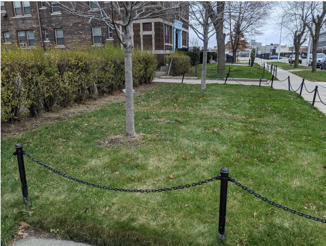
Detail view of existing landscaping at 481 Henry, with the Berwin (489 Henry) beyond. Staff photo, December 7, 2020.