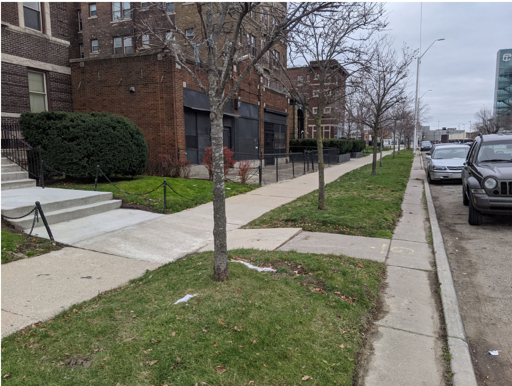
View of landscaping, sidewalk, fencing and various site elements in vicinity of Bretton Hall and 447 Henry, looking west. December 7, 2020.