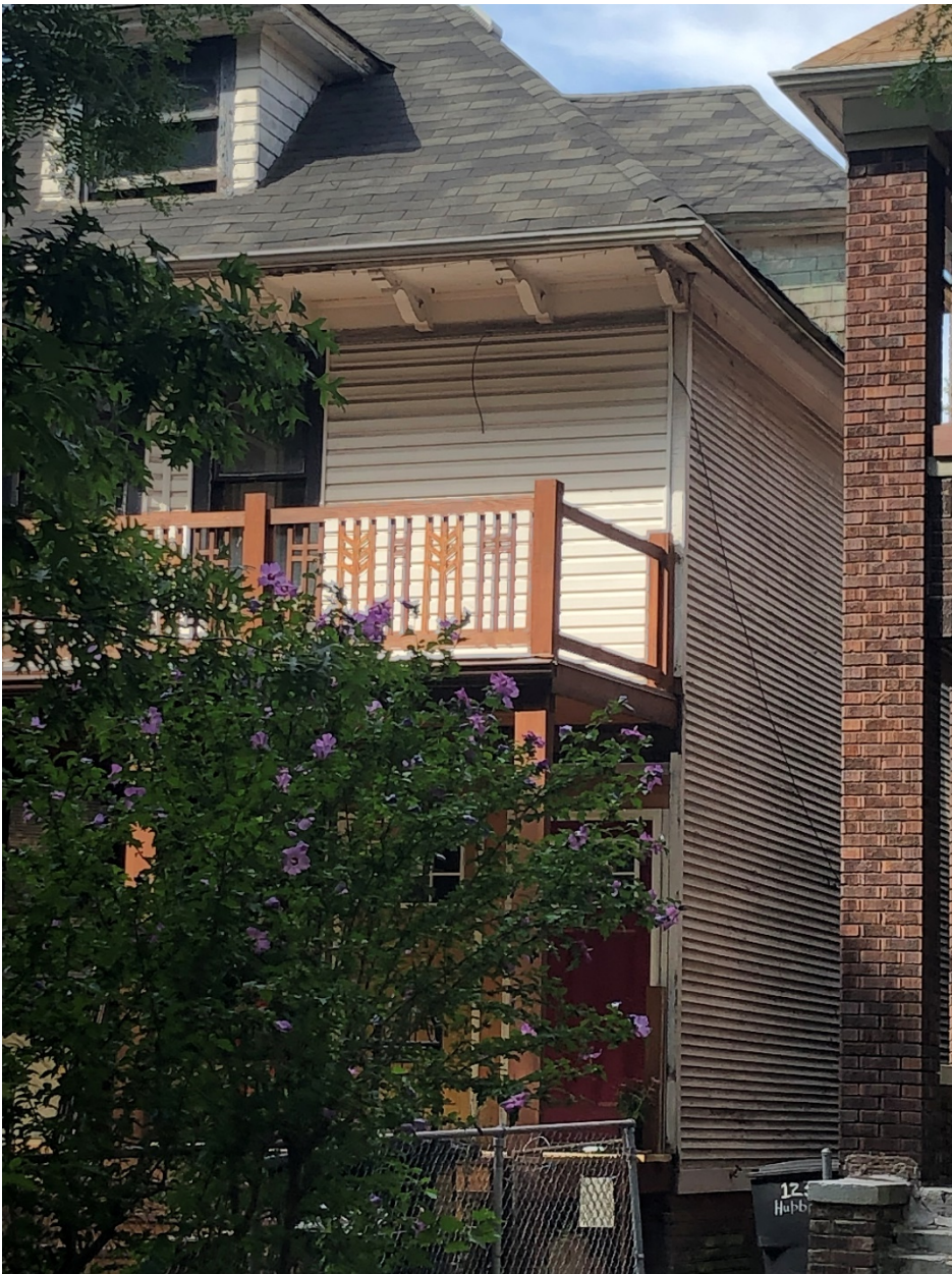
Here you see the transition from the vinyl siding to the historic narrow clapboard siding.