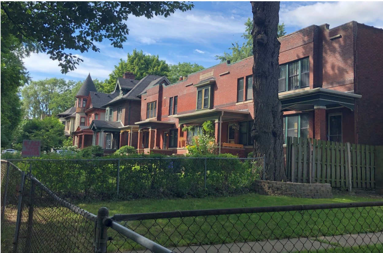
The fenced-in lots end adjacent to this two-story attached housing. The rest of this end of the street has large, single-family houses on larger lots (similar to those on the east side of Hubbard).