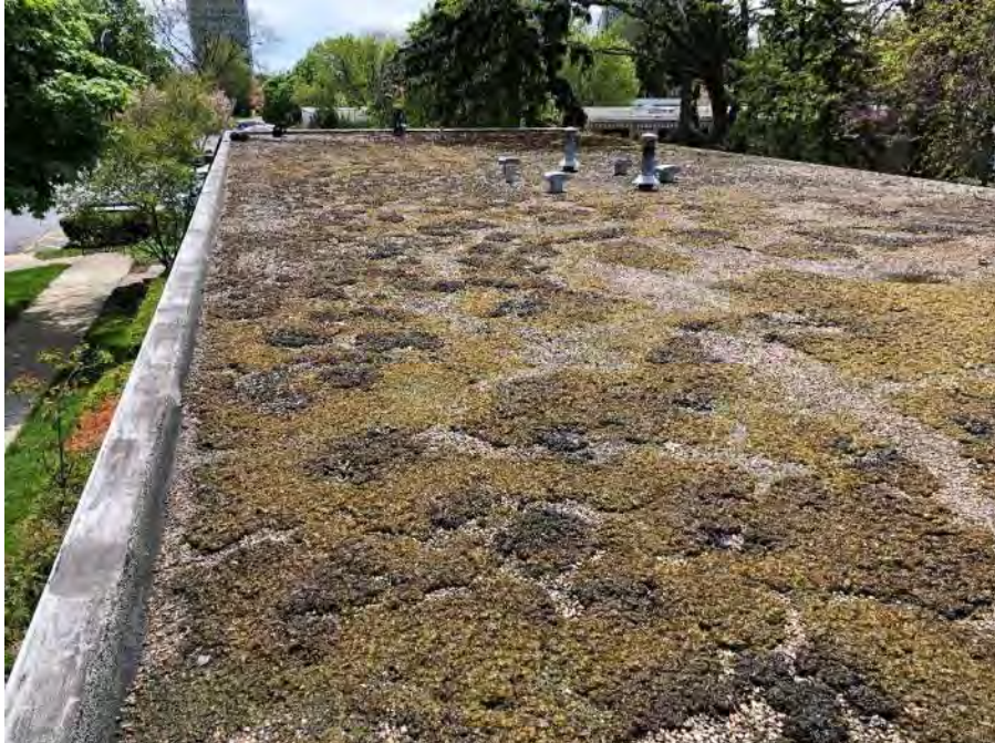
Figure 4. Overview of existing roof surface.