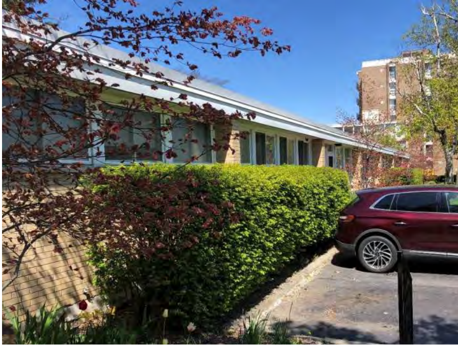
Figure 3. Overview photo of building from grade.