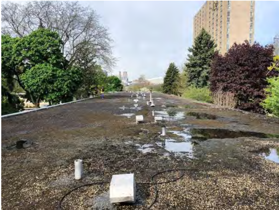
Figure 5. Overview of existing roof surface.