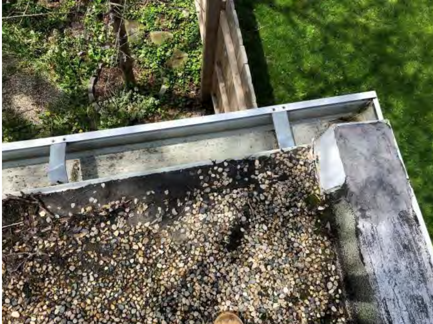
Figure 6. Detail photo of typical roof edge conditions.