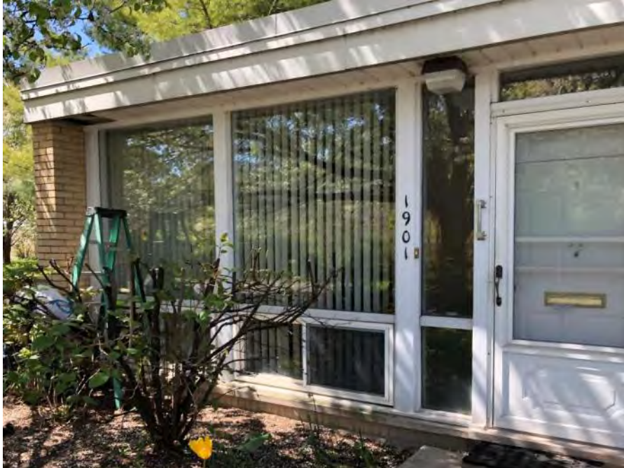
Figure 8. Existing gravel stop and fascia and soffit at front of building.