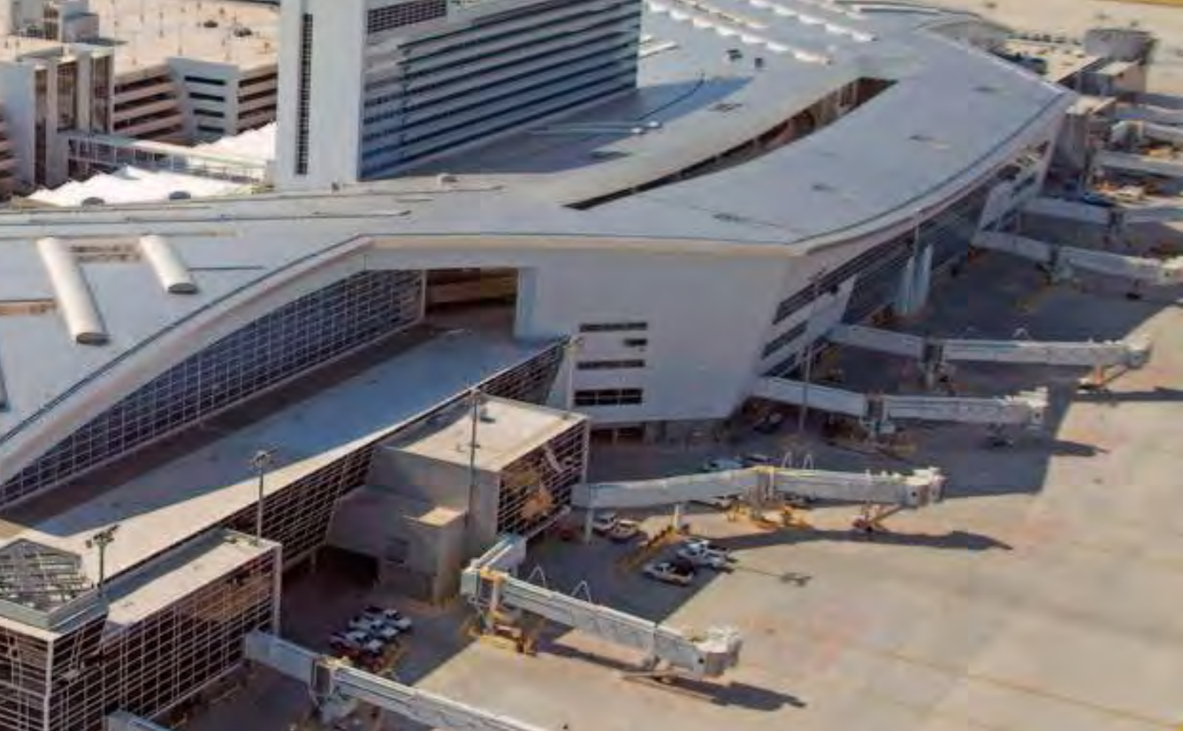
▲ Dallas/Fort Worth International Airport, Dallas, TX