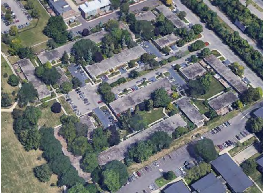
Figure 1. Aerial view of the sixteen buildings within Chateaufort Place Cooperative.