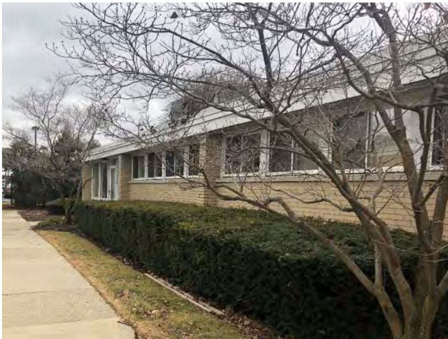
Figure 2. Overview photo of building from grade.