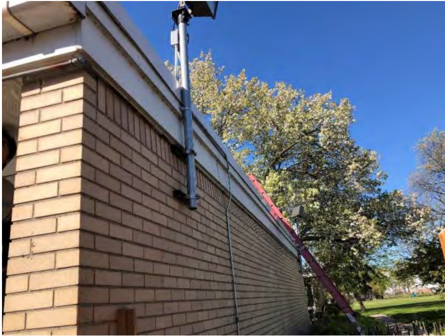
Figure 9. Existing gravel stop and fascia at side of building.