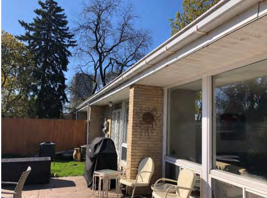
Figure 10. Existing hanging gutter, downspout, fascia, and soffit at back of building.