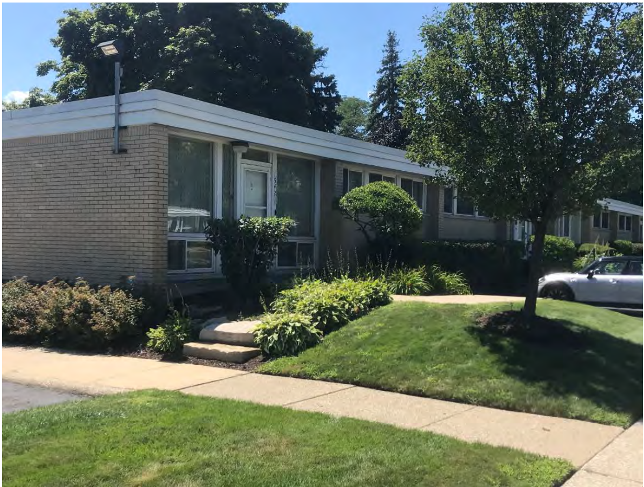
Chateaufort Place, current conditions

As per the submitted proposal, the applicant is proposing to replace the existing flat, built-up roof with a new roof. Specifically, the project seeks to remove and dispose of existing roofing systems, including: gravel surfacing, built-up roof membranes, red rosin paper, and associated base flashings down to the surface of the plywood deck while retaining the existing gutters, downspouts, fascia, and soffit panels where possible. If the removal of any area of gutters, downspouts, fascia, and/or soffit panel is necessary due to poor/deteriorated condition, the new shall be an in-kind match to the existing. As per the attached, a new membrane roof with 1/4 inch per foot tapered polyisocyanurate insulation shall be installed. To accommodate the thicker insulation, a new prefinished aluminum gravel stop flashing which measures approximately seven inches higher than the existing shall be installed. Please see the attached , which depicts the current and proposed dimensions/appearance of the gravel stop.