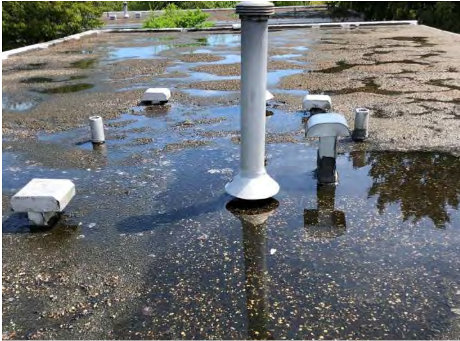
Figure 7. Detail photo of rooftop equipment and penetrations.