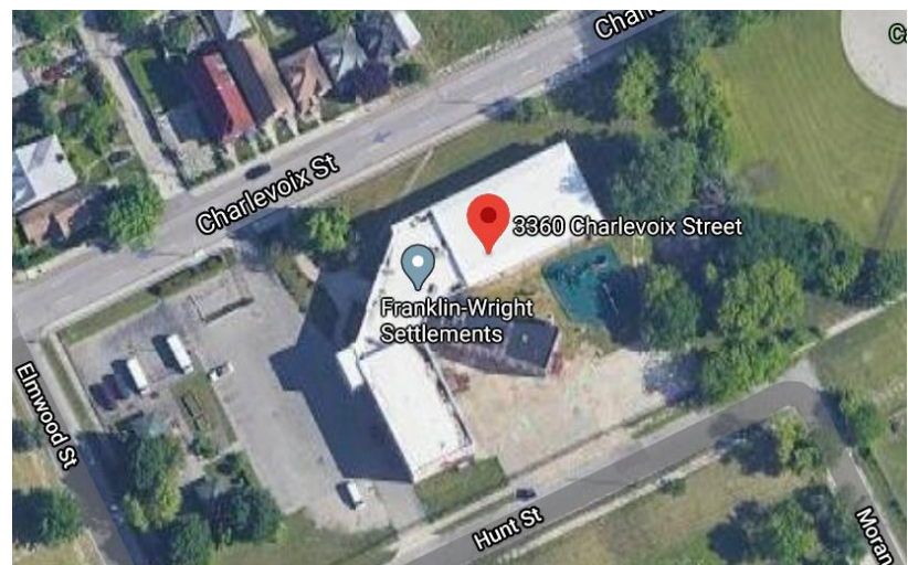
Google Maps, 2019