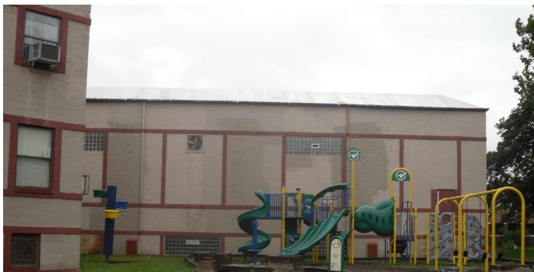
Rear/south elevation of the gymnasium. HDAB Photo, 2011.