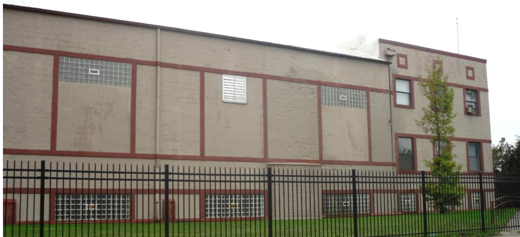
Viewer Location: Charlevoix, mid-block. The gymnasium wing extends to the east from the office/entry building. HDAB Photo, 2011.

low, sloped roof which denotes the gymnasium. There are no windows on the first floor of the gymnasium; the second floor's openings alternate between mechanical registers and glass block, each of which is centered above the basement windows. The rear/south façade of the gymnasium (facing the courtyard and Hunt Street) also has alternating glass block openings and mechanical registers.