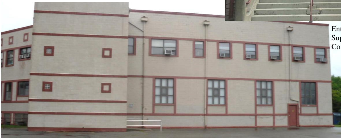
West Elevation, Auditorium facing Elmwood. HDAB Photo, 2011.

A protruding two-story bay with small glass block windows separates the entry/office bay from the auditorium wing. The auditorium façade has four large windows on the first floor, each with nine panes of glass; the center pane is operable.