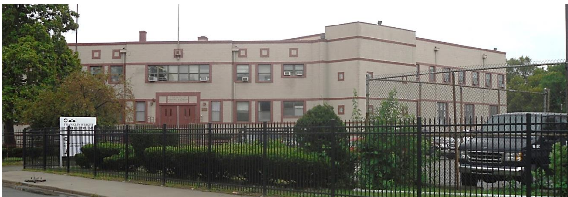
The main entry façade faces northwest toward Charlevoix and was built at a 45-degree angle to the north and west-facing wings. HDAB Photo, 2011.