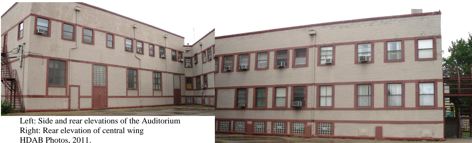
Left: Side and rear elevations of the Auditorium Right: Rear elevation of central wing

The remainder of the south and east elevations of the auditorium/dormitory wing and central wing were designed in a style similar to the primary façades.