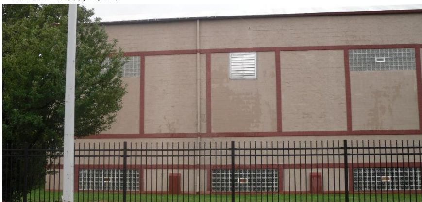
Above: Continued north elevation of the gymnasium. HDAB Photo, 2011.