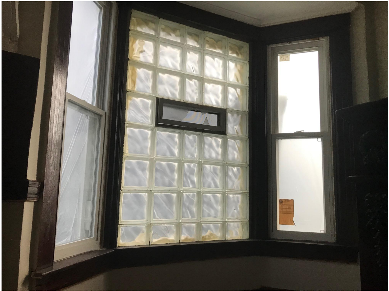
Example of Historic Wooden sashes that Metro Detroit Window will build for: Landing, Bay Window, and Attic.