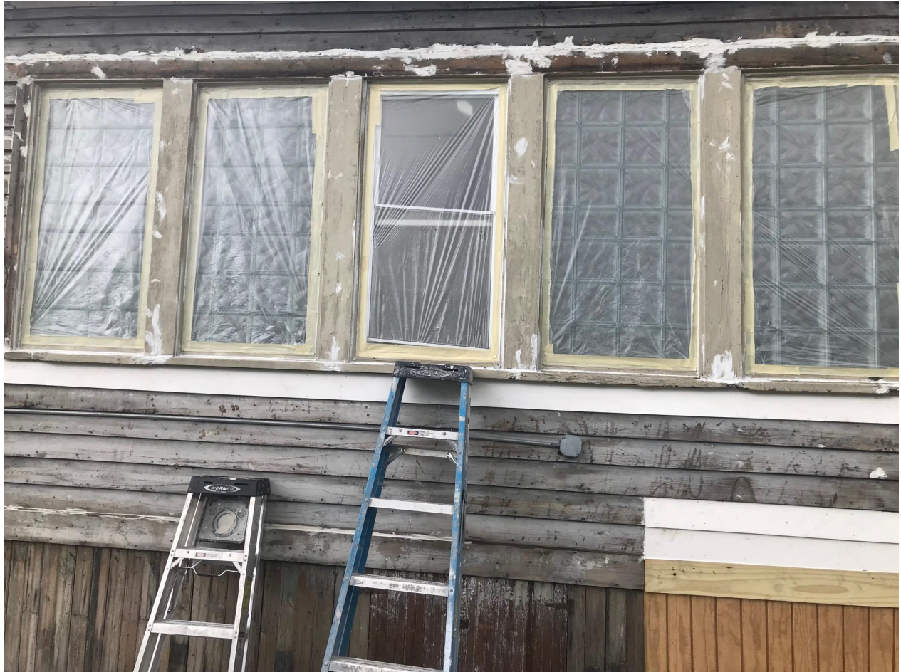
Exterior of Three Season room: West facing side of home