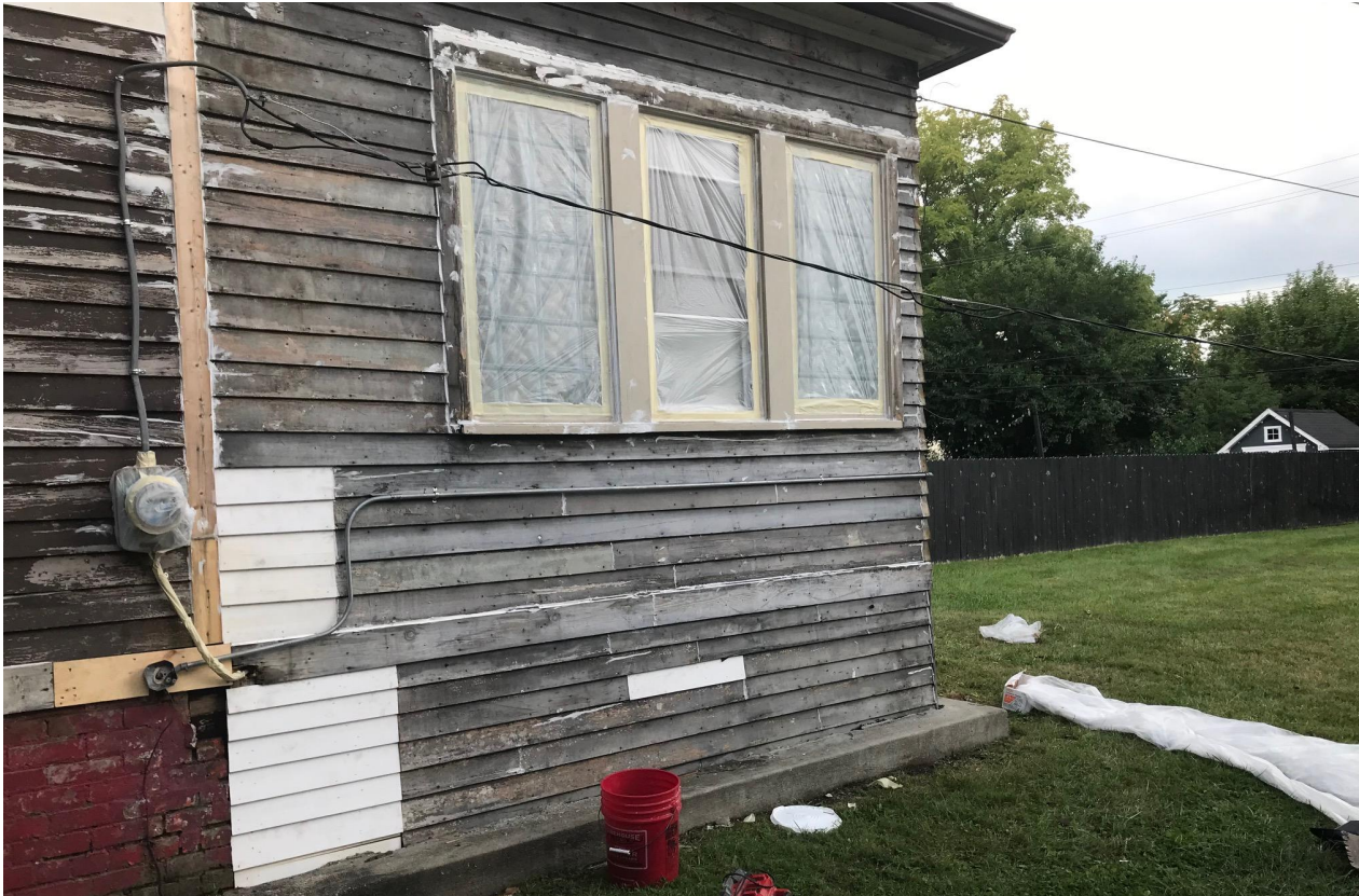
Exterior of three season room, North side of home: