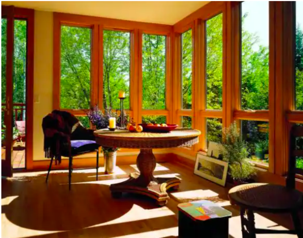
“Three Season Room Material Sample Andersen 400 Series”