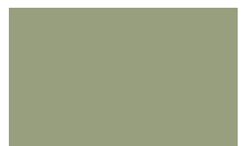
E:4 Grayish Yellow Green MS: 7.5GY 6/2