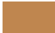
E:2 Strong Yellowish Brown MS: 7.5YR 6/8