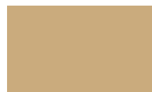
A:5 Grayish Yellow MS: 2.5Y 7/4