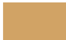
B:4 Moderate Yellow MS: 2.5Y 7/6