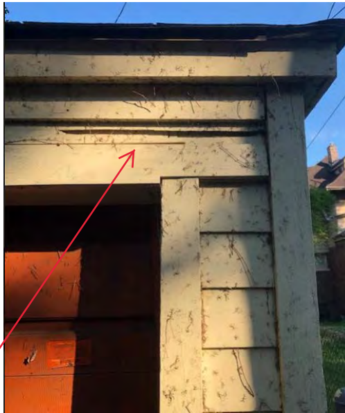
damaged, cracked siding