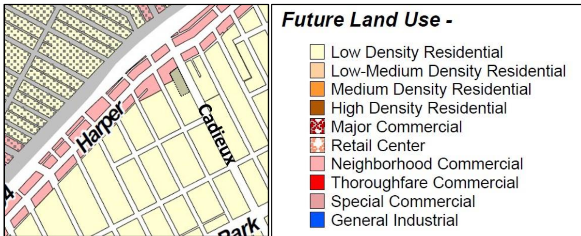
The location of the proposed rezoning is shaded

Neighborhood Commercial (CN). Generally, B1 and B2 zoning classifications are considered to be appropriate in the CN designation. The B4 zoning classification is generally not considered to be appropriate in the CN designation. Despite this the vast majority of land along Harper Avenue is currently zoned B4. The intersection of Harper and Cadieux hosts gas stations and fastfood restaurants with drive-through. The subject site has a Master Plan designation of Low Density Residential (RL) in which no business district zoning classification is considered to be appropriate. Rezoning the subject site to B4 would cause the business district to further encroach into the neighborhood.