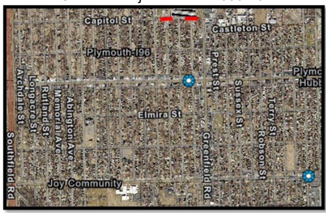
CWSRF Project Number 6002-01

Sewer Pipe Rehabilitation and Manhole Rehabilitation/Replacement District 7 Locations in the City of Detroit (zoomed in views)