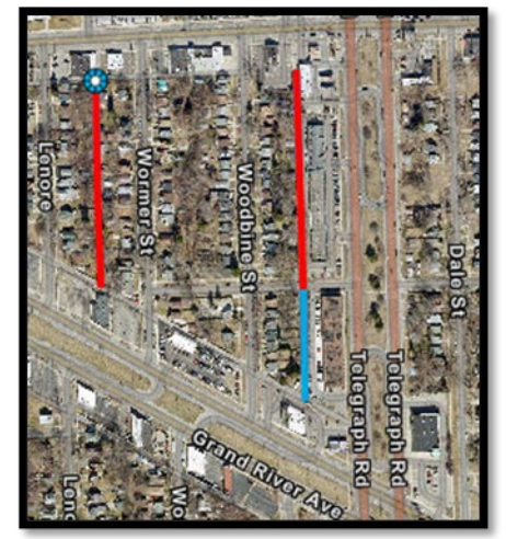
CWSRF Project Number 6002-01

Sewer Pipe Rehabilitation and Manhole Rehabilitation/Replacement Additional District 1 Locations in the City of Detroit (zoomed in views)