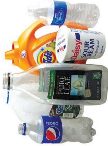
Hard Plastics (#1-7)