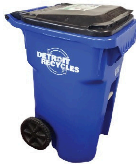
Recycling Cart (96-gallon)