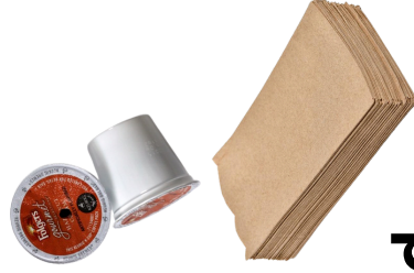
Disposable Food Items