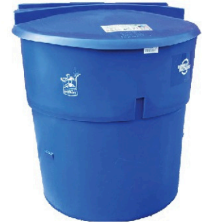
Recycling Dumpster (450-gallon)