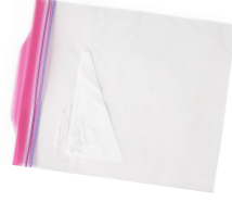
Plastic Bags & Film