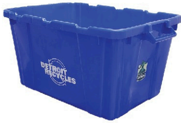
Recycling Bin (18-gallon)