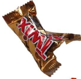
Pouches & Wrappers