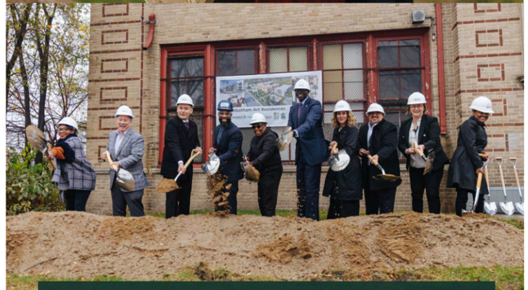
Higginbotham Ground Breaking ceremony on November 19, 2024.