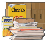
Cereal Boxes, Newspaper, Magazines and Mail, Flattened Cardboard & Paper Tubes