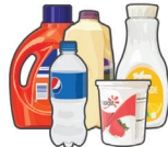
Kitchen, Laundry, Bath: Bottles and Containers EMPTY AND REPLACE CAP