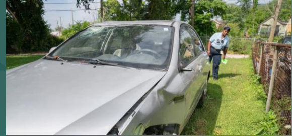
During a ride-along, code enforcement officers identified inoperable vehicles to be towed or scrapped.