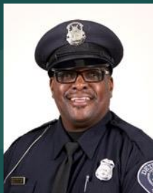
NPO Donald Parker