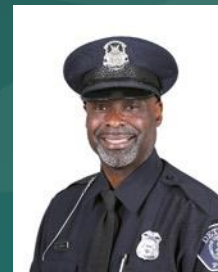
NPO Charles Rodgers