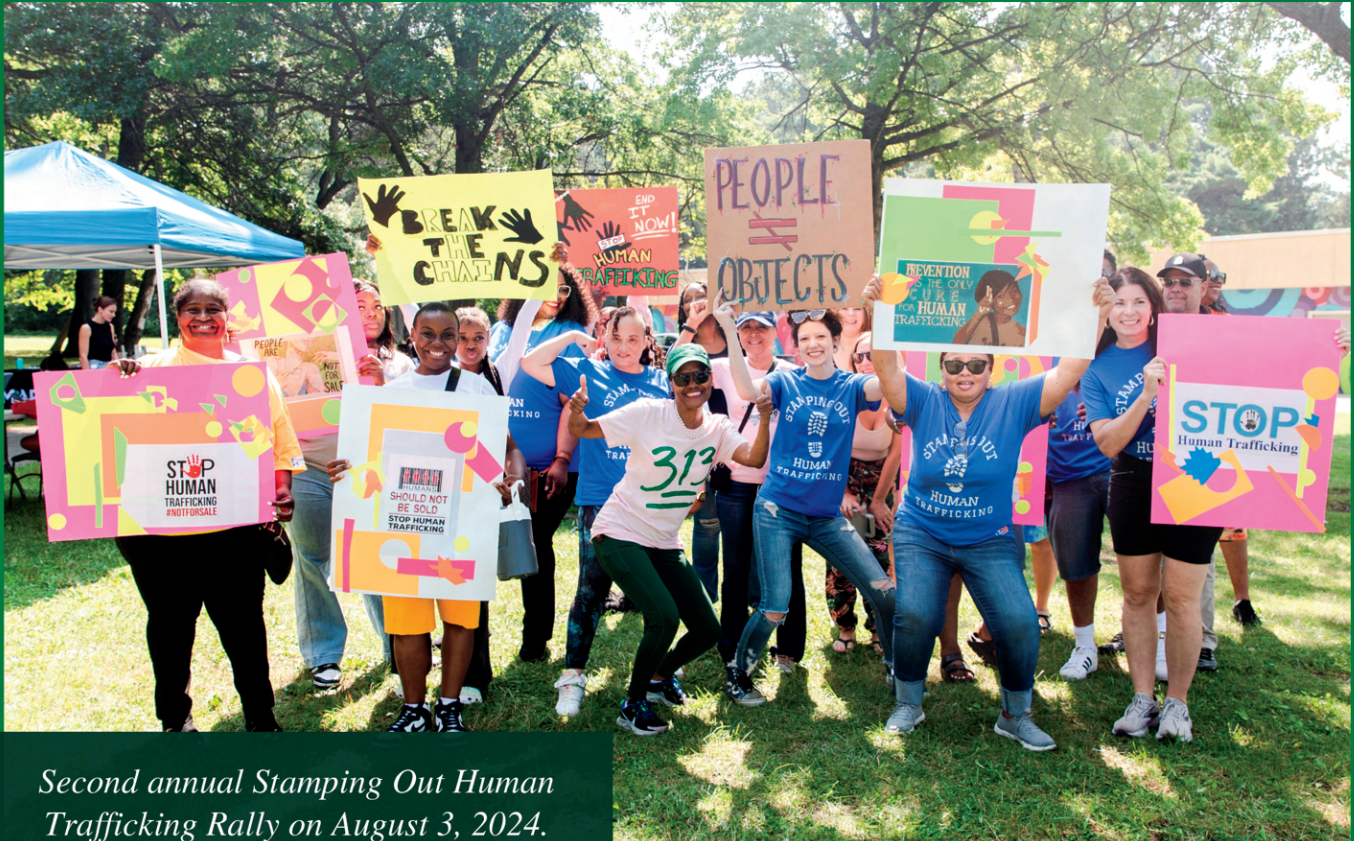
Second annual Stamping Out Human Trafficking Rally on August 3, 2024.