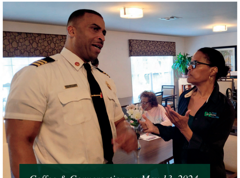
Coffee & Conversation on May 13, 2024.