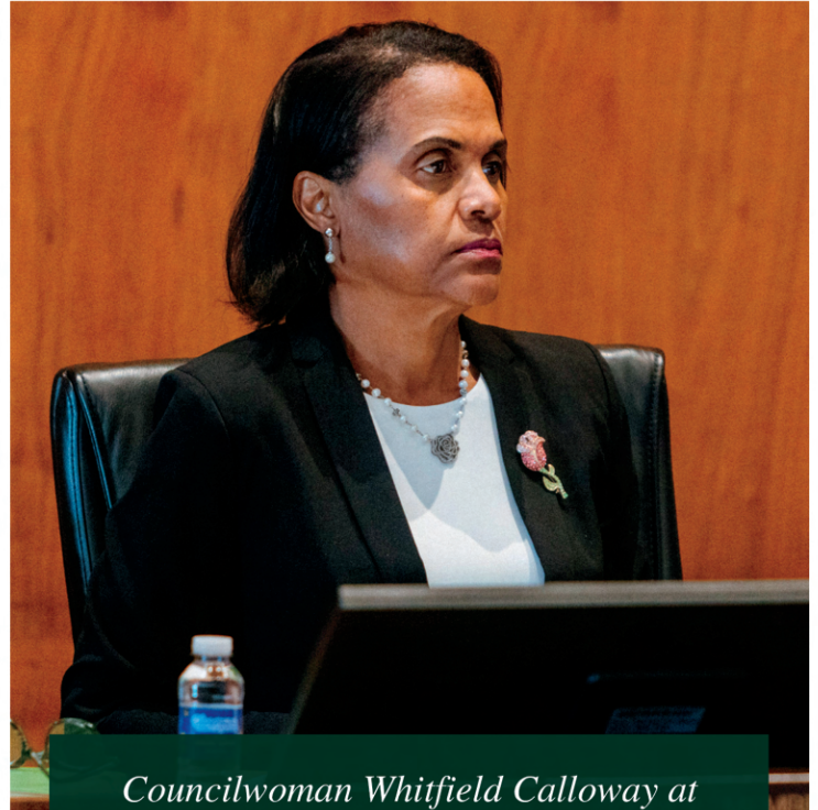
Councilwoman Whitfield Calloway at Formal Session on September 3, 2024.

Election Day In-Person: At your designated polling location on Aug. 6th. from 7 AM-8 PM.