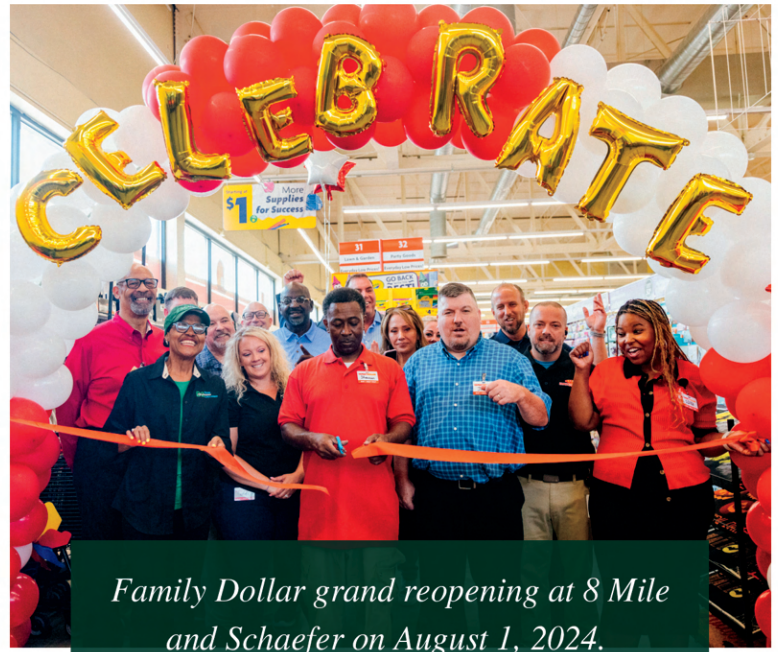
Family Dollar grand reopening at 8 Mile and Schaefer on August 1, 2024.

Her efforts paid off. A few months later, on August 1, she and her team attended the grand reopening of the Family Dollar at 8 Mile and Schaefer. They were pleased to find a transformed store—clean, well-organized, and equipped with improved lighting and