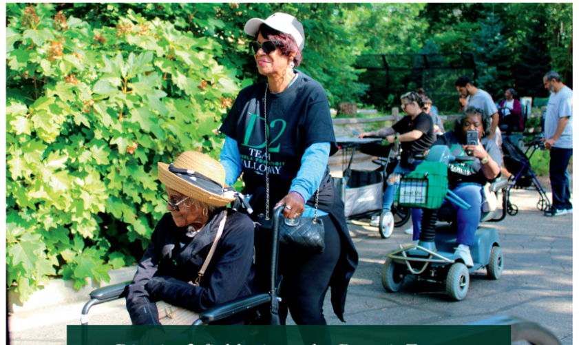
District 2 field trip to the Detroit Zoo on August 21, 2024.