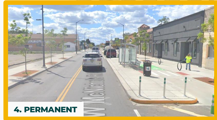
McNichols Rd Example