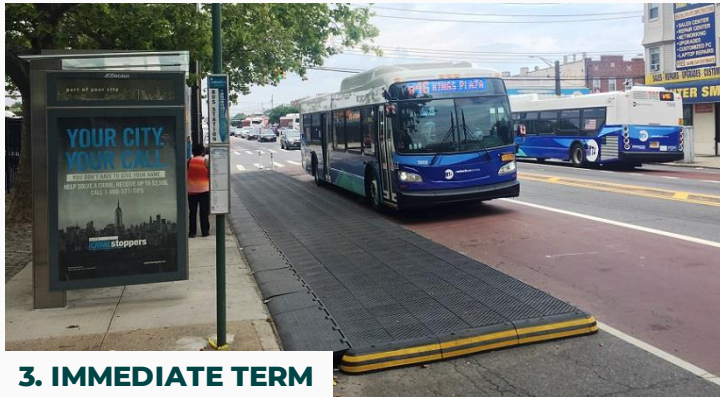
Bronx, NY Example