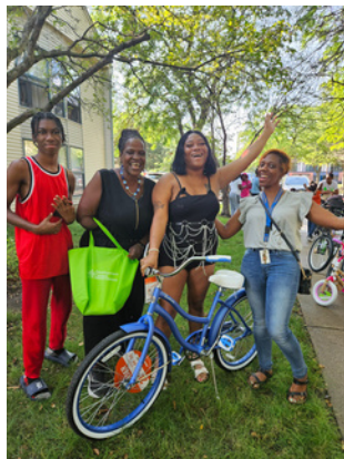
Bike, game, & gift card raffle provided by Development Centers