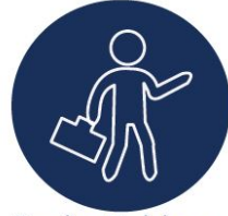
Traveling Workshops October 2019