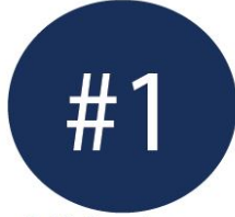
Public Interview MARCH 2019