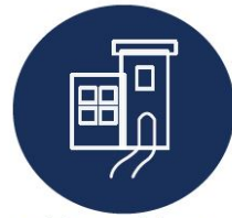
Building Workshops Winter 2019