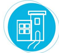
GREATER CORKTOWN BUILDING WORKSHOP COMING WINTER 2019