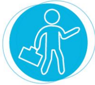
HISTORIC CORKTOWN TRAVELING WORKSHOP OCT. 9TH | 5:30-7:30PM @ IBEW HALL