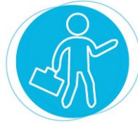
NORTH CORKTOWN TRAVELING WORKSHOP OCT. 10TH | 5:30-7:30PM @ TEAMSTERS HALL