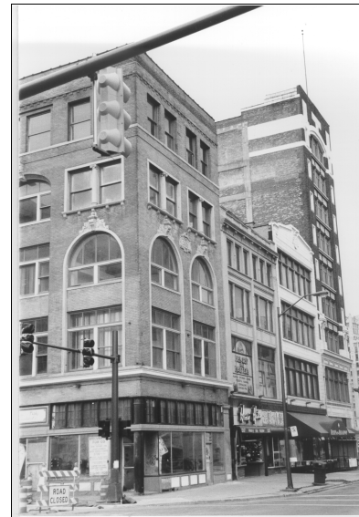
The Cary Building

Individually listed on the National Register of Historic Places on November 25, 1983, The Cary Building is a buff brick and like-colored terra-cotta trimmed, five-story commercial/office building with a reinforced concrete frame. Extending 112 feet along Gratiot Avenue and thirty-four feet along Broadway, the building displays broad, round, segmental-arched and square-headed window openings in its 2 nd through 4 th story portion and paired square-headed windows in the top floor. In the 4 th floor a small ionic column separates the windows in each window pair in the Broadway façade and each end window pair on the Gratiot façade. The windows in the 2 nd through 4 th floor center bays on the Gratiot side are set into segmental-arched head recesses, while the 3 rd story windows on the Broadway façade and ends of the Gratiot façade are arched. The recesses and arched windows all display boldly projecting keystone devices. A projecting main cornice of simple design has been removed.