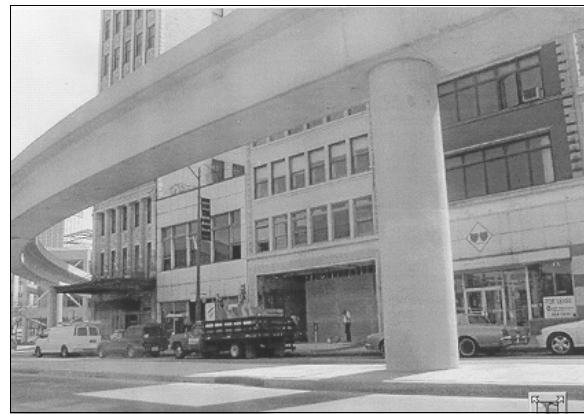
West side of the 1500 block

The first story of the fourteen-story Wurlitzer Building is composed of a curving storefront windows flanking the double-door, recessed entrance. Overhanging the ground floor is a projecting marquis-like structure bearing the name, “Wurlitzer Building,” likely put on when the first floor was remodeled. Above the first floor, at mezzanine level, is a tall, classical temple front with fluted columns dividing the façade into five bays, each containing a large double-hung sash window. Elaborately decorated spandrels with cartouches and blue colored terra cotta, and a decorative Adamesque entablature support the ten more austere stories above. Rope moldings line the sides of the tall pilasters of the mezzanine level and continue up the rest of the stories. The upper story is crowned with a raised pediment over a large window.