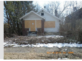
4. 21369 KARL Sale Starts May 7, 9am $1,000