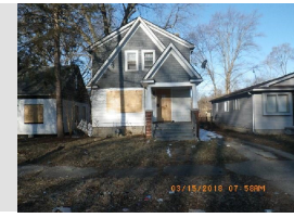
5. 17729 WESTBROOK Sale Starts May 7, 9am $1,000