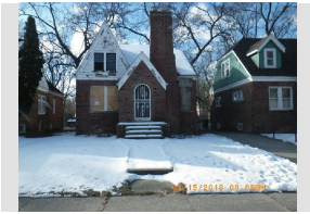
13. 21145 SANTA CLARA Sale Starts May 7, 9am $1,000