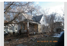
15. 17216 CHAPEL Sale Starts May 7, 9am $1,000