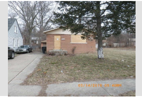
10. 21622 SANTA CLARA Sale Starts May 7, 9am $1,000