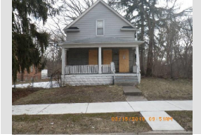
8. 17622 TRINITY Sale Starts May 7, 9am $1,000