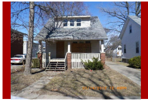
2. 21722 CURTIS Auction on May 14th (9am-5pm) Begins at $1,000