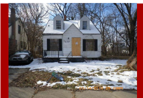
12. 21457 SANTA CLARA Auction on May 13 (9am-5pm) Begins at $1,000