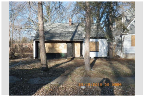
6. 17721 WESTBROOK Sale Starts May 7, 9am $1,000