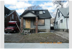
14. 17513 TRINITY Sale Starts May 7, 9am $1,000