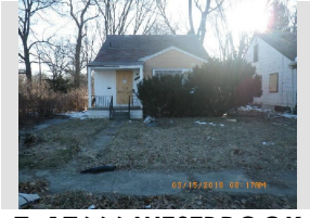
7. 17666 WESTBROOK Sale Starts May 7, 9am $1,000