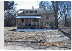
3. 21535 CURTIS Sale Starts May 7, 9am $1,000