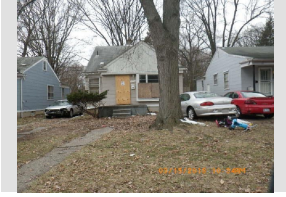
9. 17597 PIERSON Sale Starts May 7, 9am $1,000