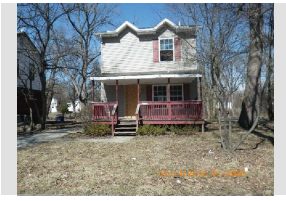
1. 21636 KARL Sale Starts May 7, 9am $1,000

Tour two of the homes - 21457 Santa Clara and 21722 Curtis - on Sat May 5th ( 1 - 5pm)